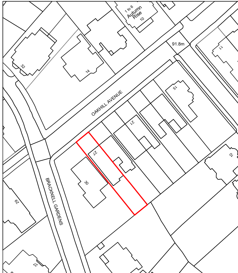
1 SITE LOCATION PLAN SCALE 1:1250 @ A4