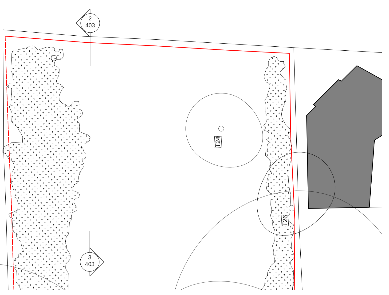
1 KEY PLAN Scale: 1:100