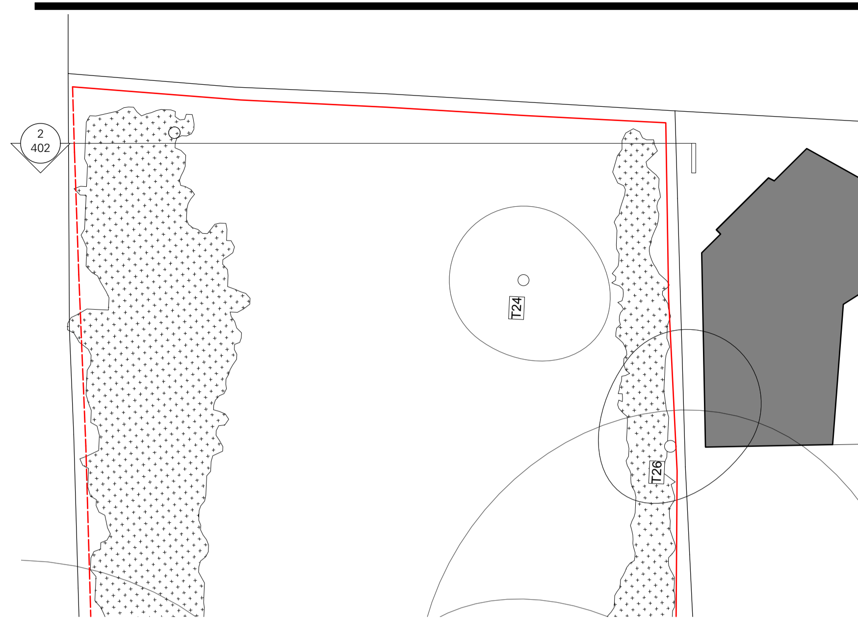
1 KEY PLAN Scale: 1:100