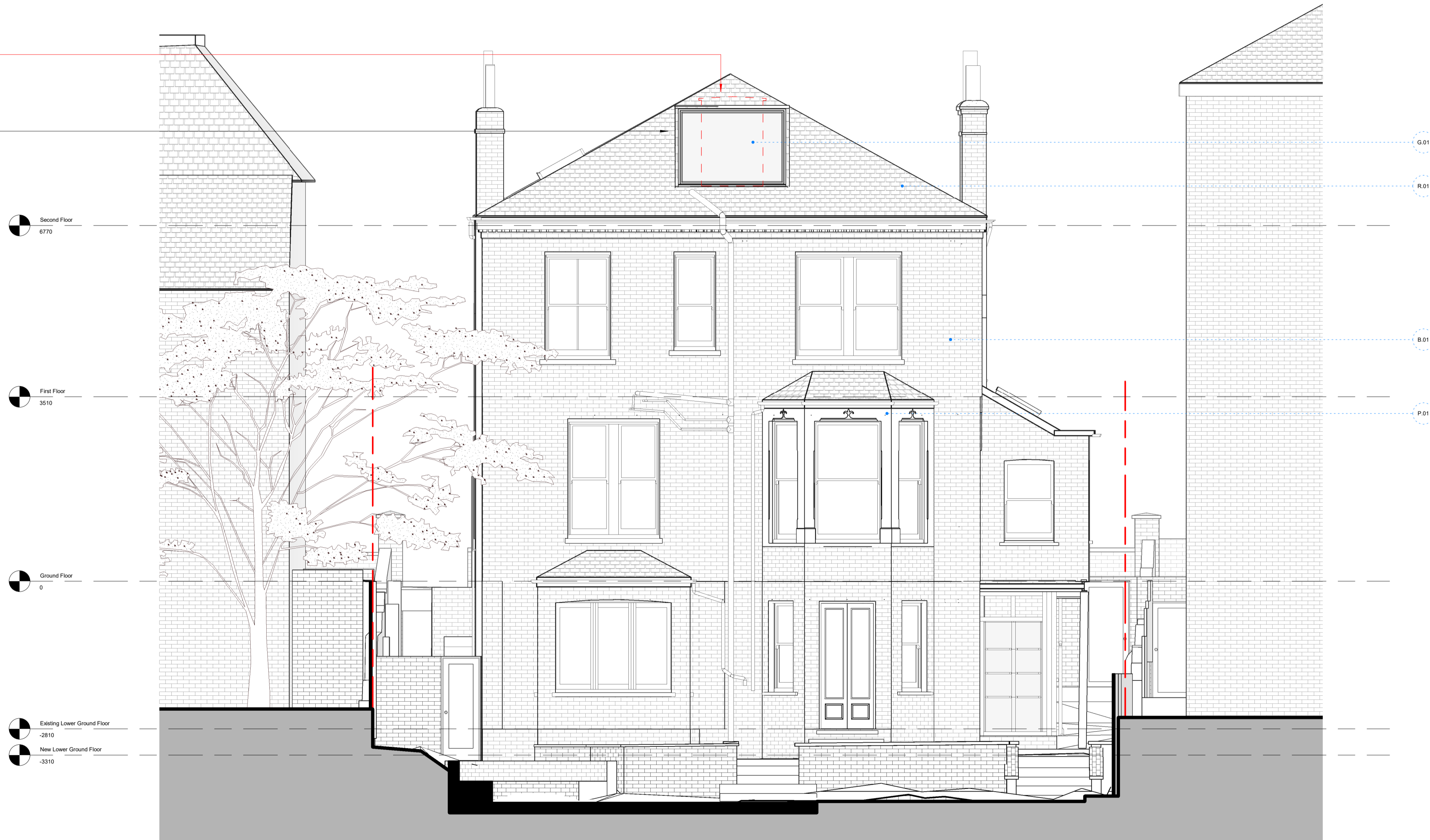
1 West Elevation - Proposed 1 : 50