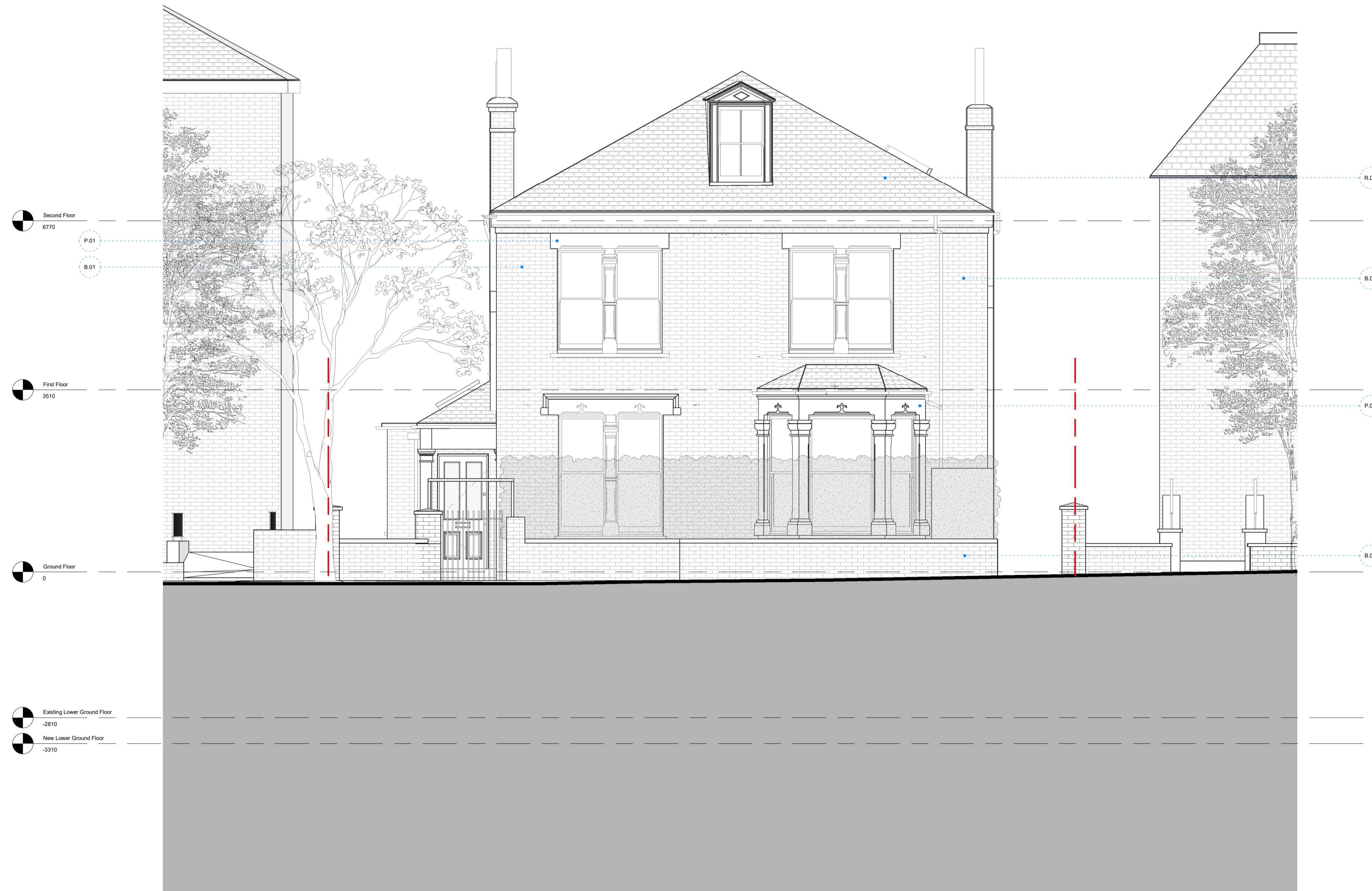
1 East Elevation - Proposed 1 : 50