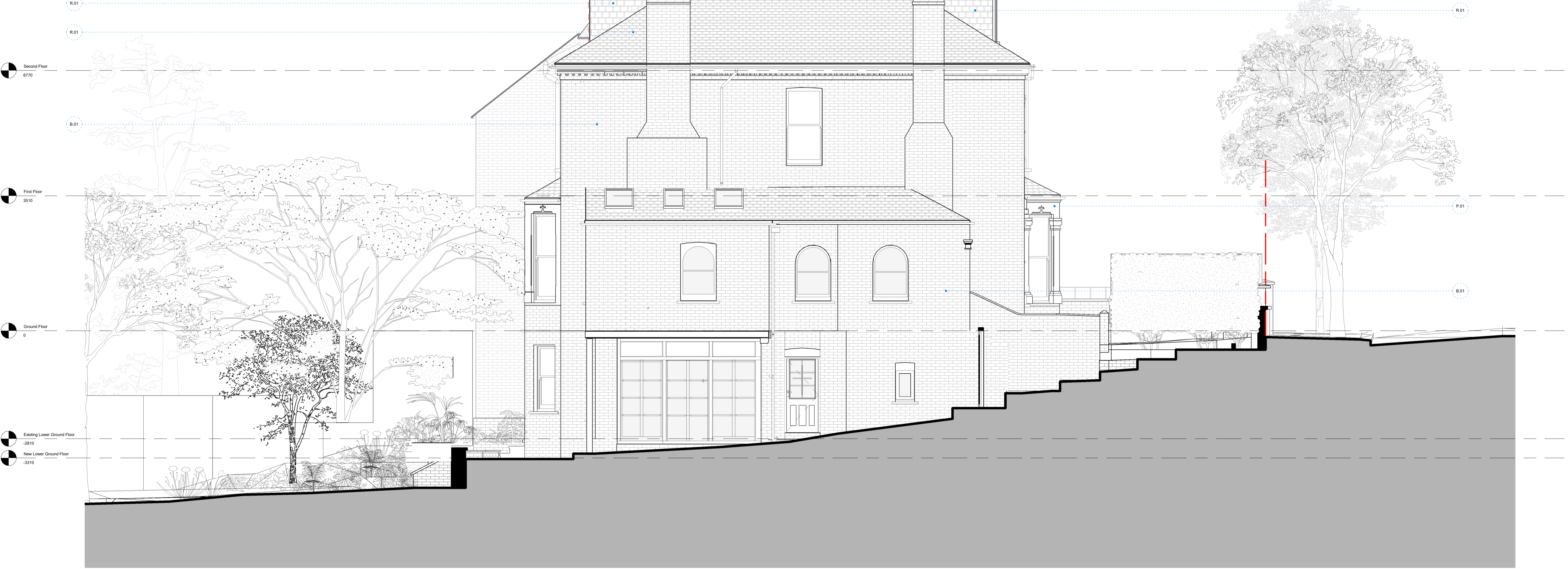
1 South Elevation - Proposed 1:50