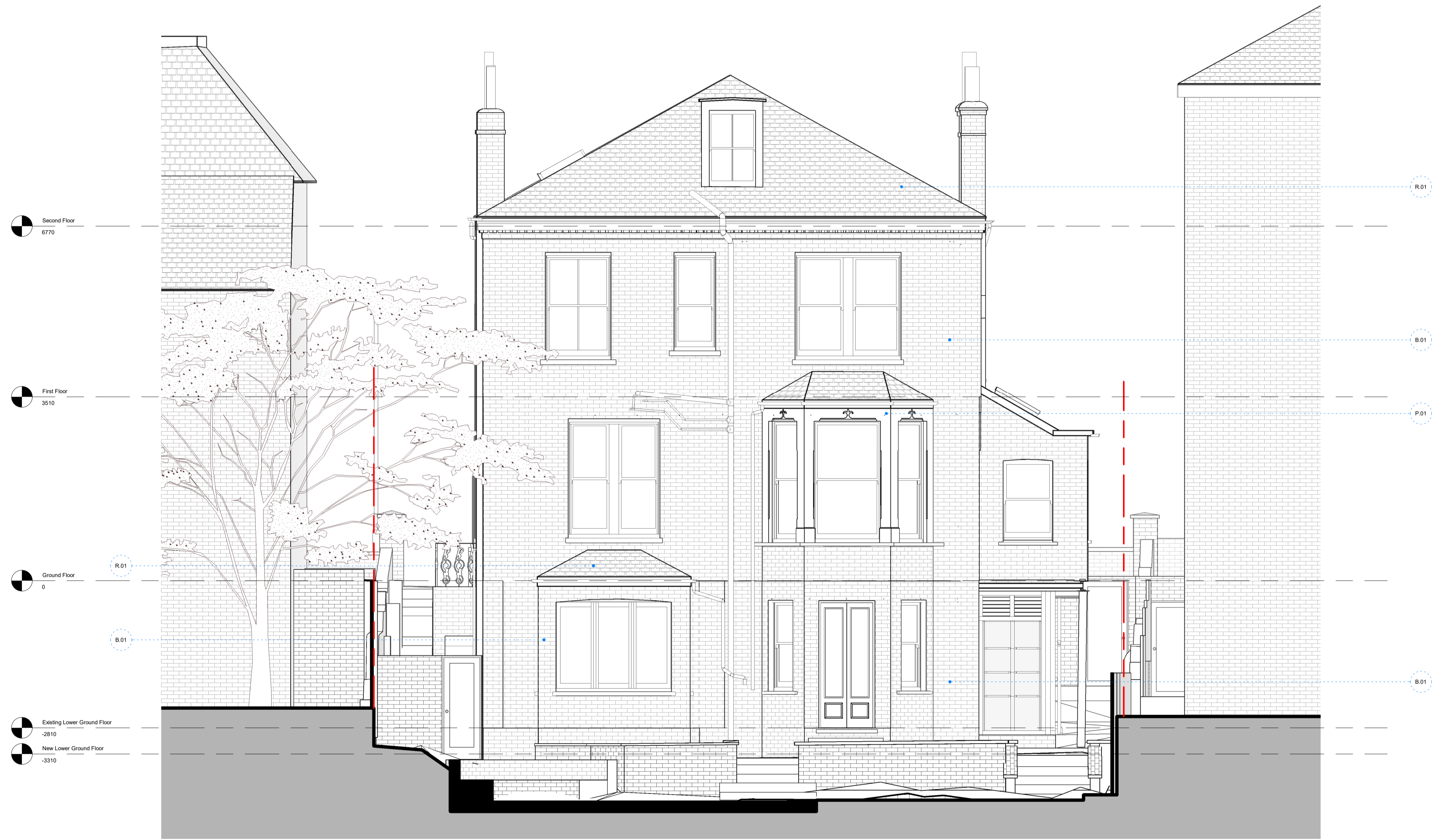
1 West Elevation - Existing 1 : 50