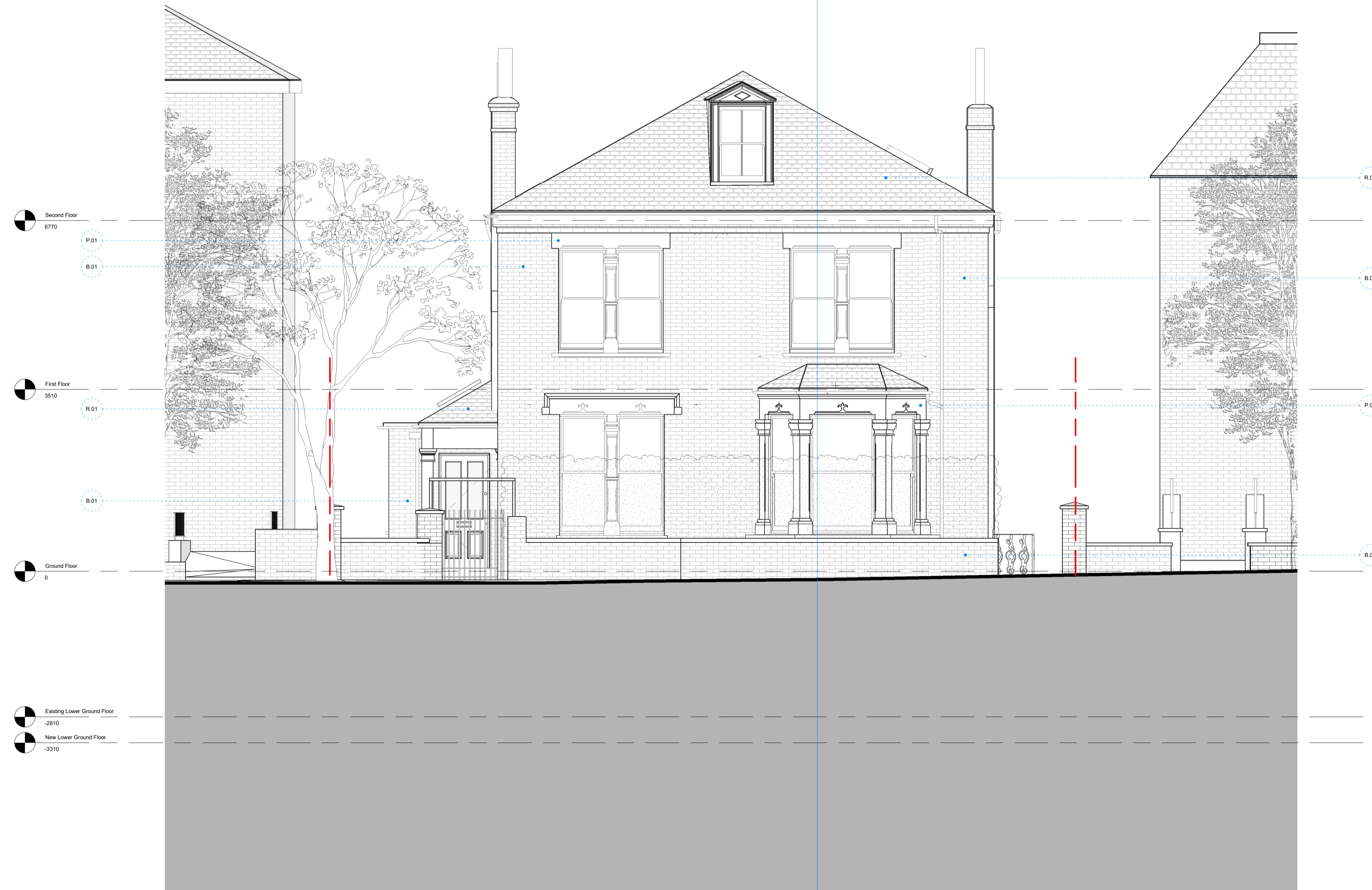
1 East Elevation - Existing 1 : 50