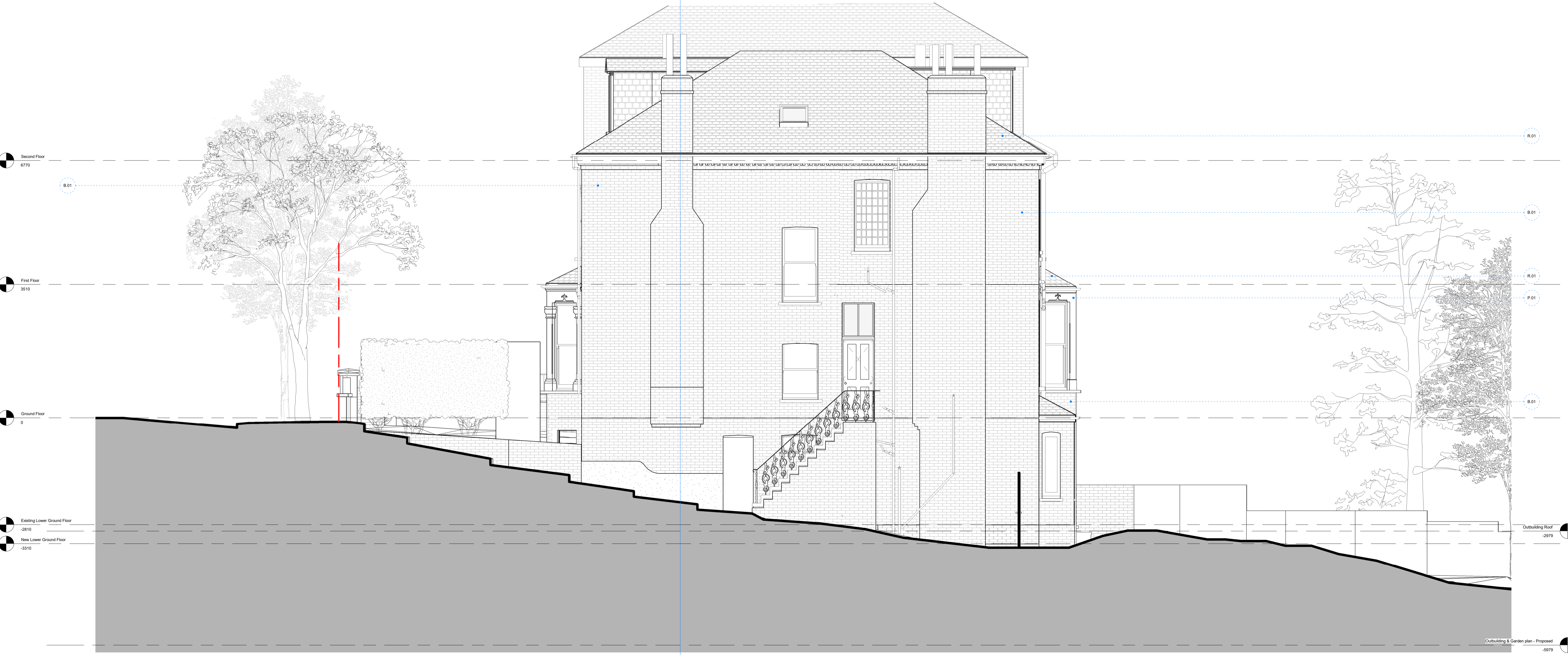
1 North Elevation - Existing 1 : 50