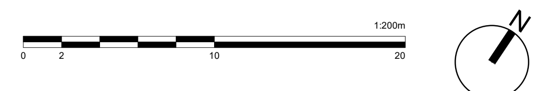
Lower Ground Floor Plan SCALE: 1 : 200