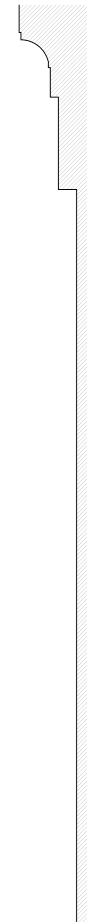
2 PROP ELEV (SIDE) 1:20 @ A2