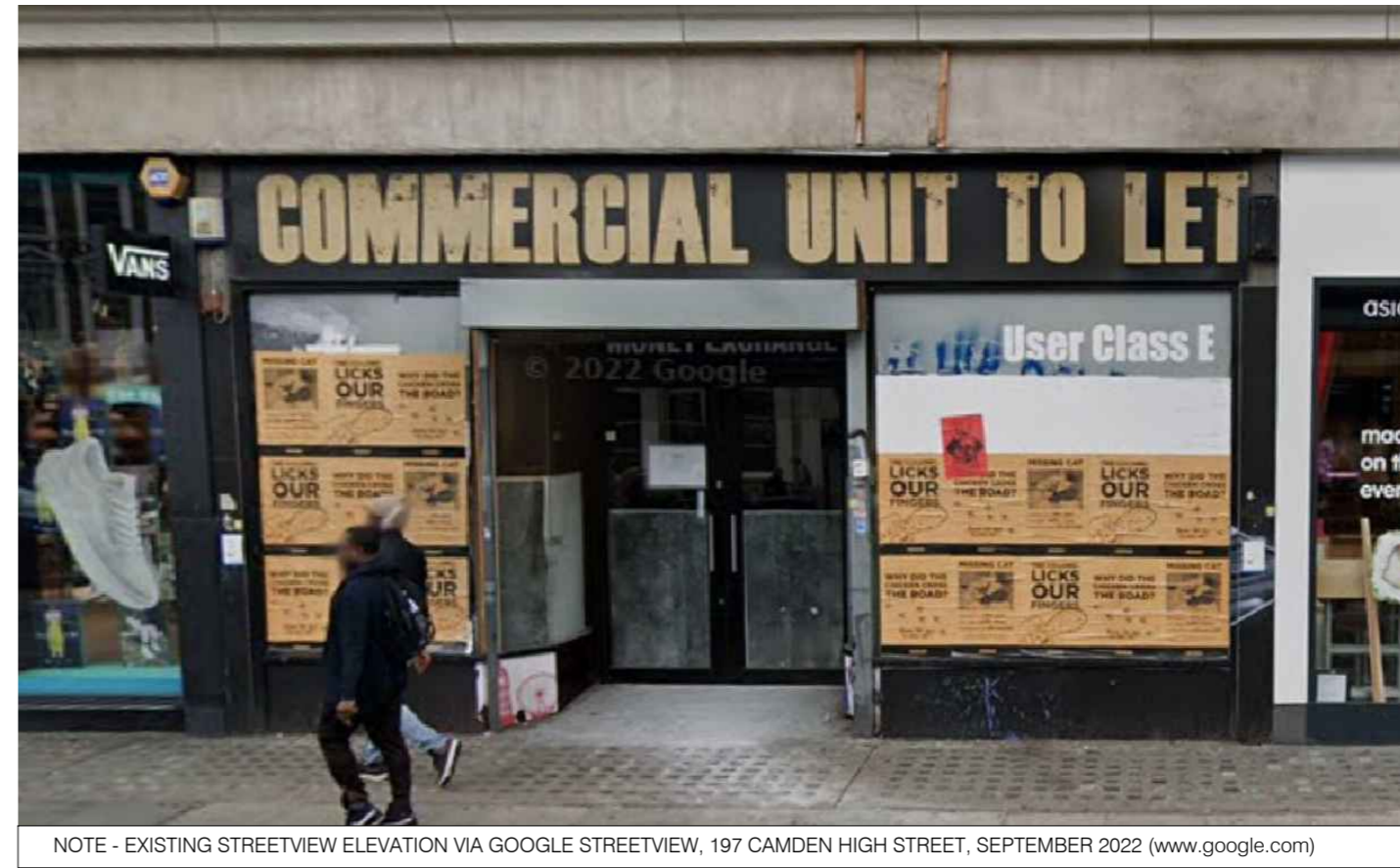
NOTE - EXISTING STREETVIEW ELEVATION VIA GOOGLE STREETVIEW, 197 CAMDEN HIGH STREET, SEPTEMBER 2022 (www.google.com)