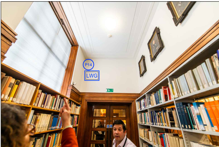
Room 419 (Middlesex North Reading Room), looking east. All devices shown are indicative of locations only. Not to scale.