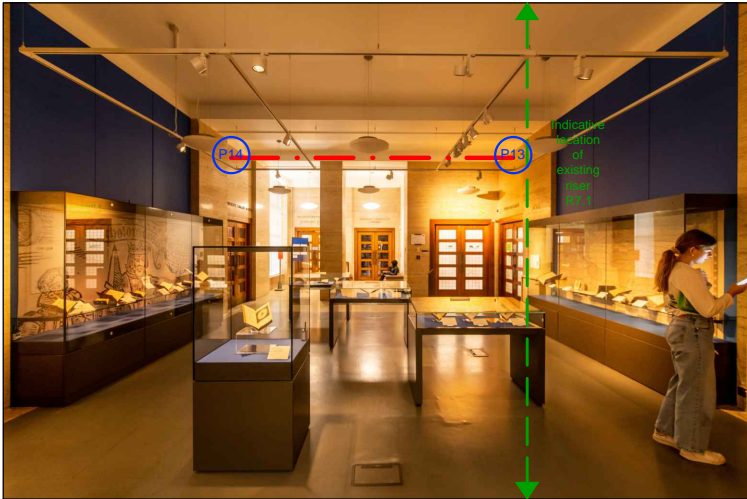
Room 410 (Information Centre), looking north. All devices/penetrations shown are indicative of locations only. Not to scale.

Galvanised conduit will run along the wall above the travertine finishes. The exact location of the penetrations (P13 & 14) and cable route (indicated by the red dotted line) will be confirmed by the specialist contractor during the construction phase.