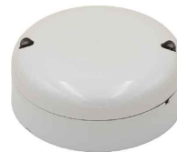
Proposed LWG to be installed. For further details of this device, please refer to Appendix 5 of the heritage, design & access statement.