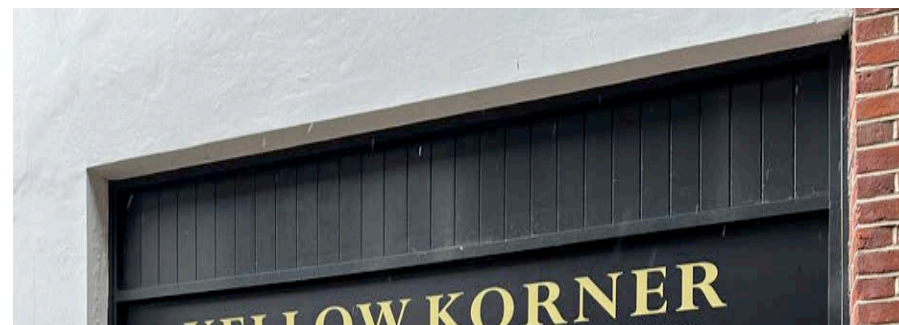
EXISTING SITE CONDITION SHOWING PANELLED TIMBER FASCIAS TO WINDOWS ONTO PERRIN'S COURT