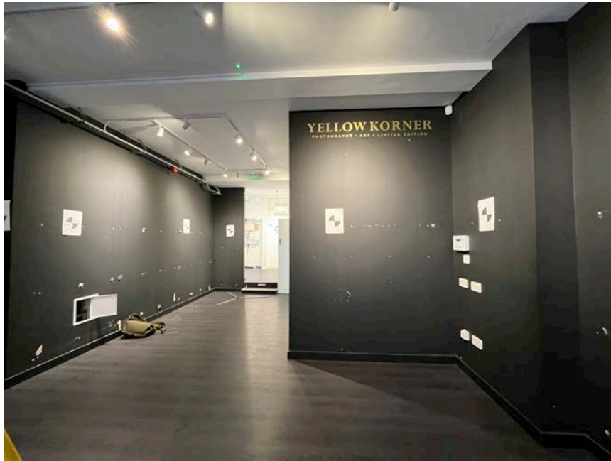
GROUND FLOOR MAIN SHOPFLOOR AREA (FRONT)