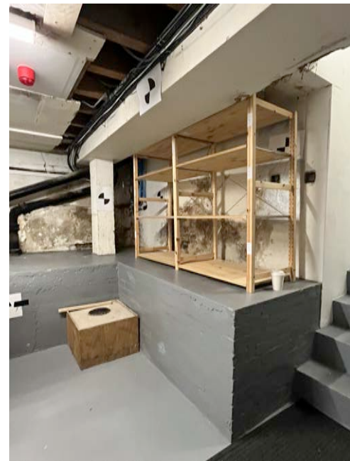
BASEMENT BACK OF HOUSE STORAGE AREA