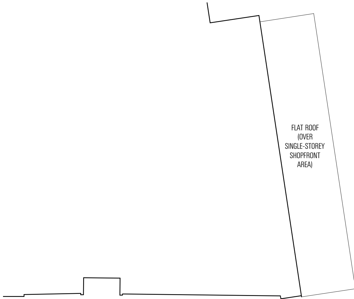
1 EXISTING - ROOF PLAN 1:50 EXISTING CONDITION RETAINED NO NEW WORKS PROPOSED