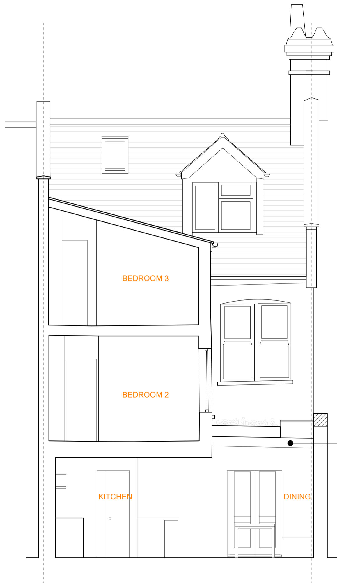
Proposed Section CC

Proposed side infill with exposed timber joisted ceiling & linear perimeter rooflight. (Hatched area denotes height increase of party wall).