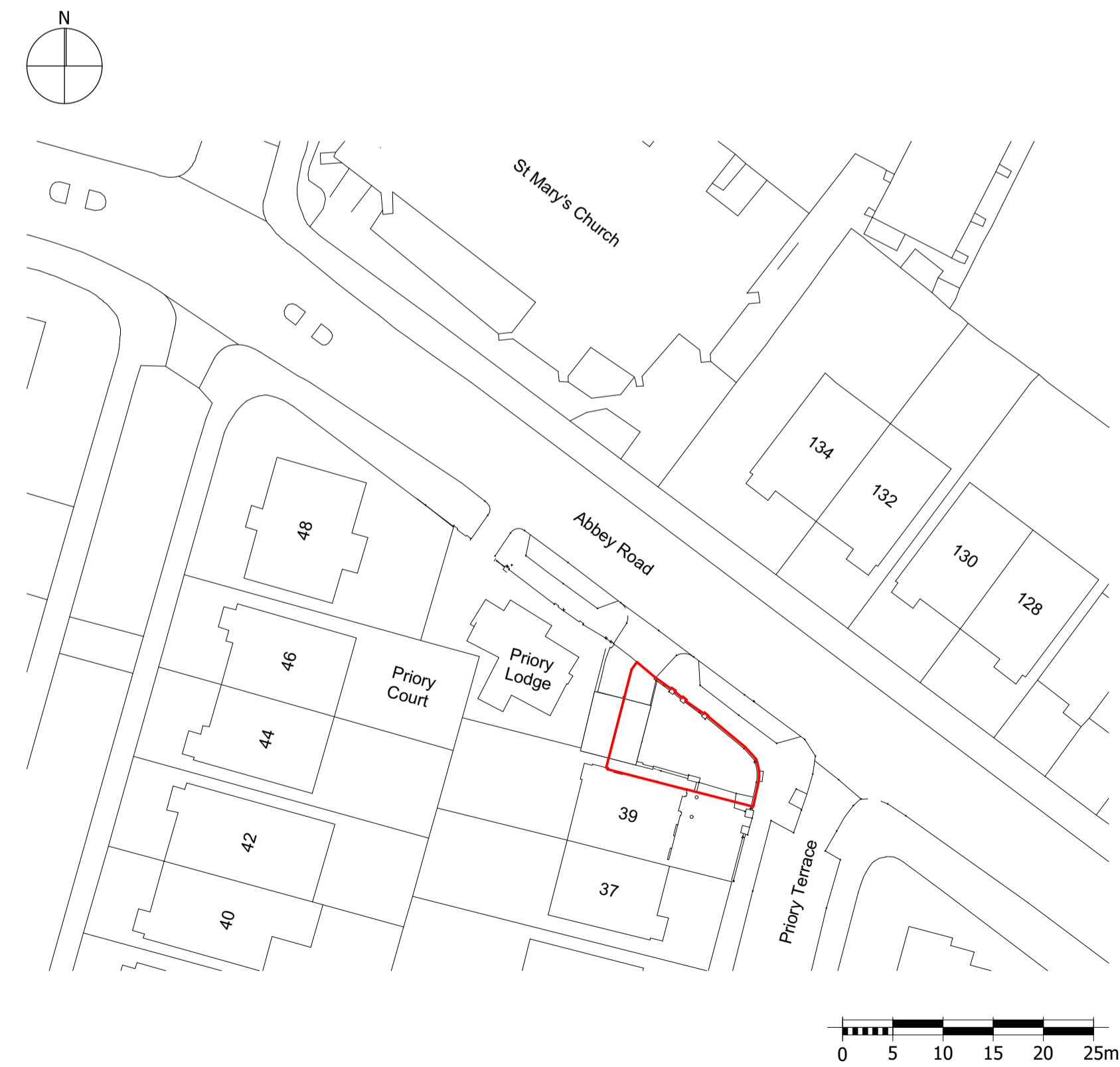
2 SCALE 1:500 @ A1 EXISTING LOCATION PLAN