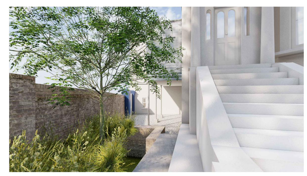
View of the existing extension from 36 Upper Park Road

Aerial view of the existing extension from Tasker Road