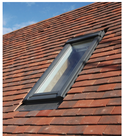
Velux conservation rooflight