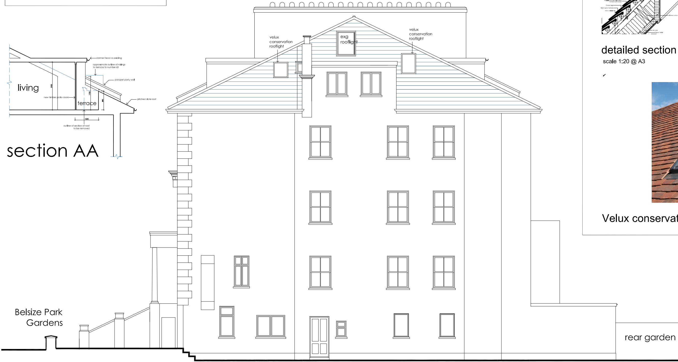
flank elevation (east)