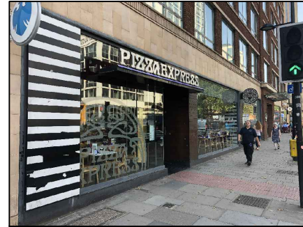
VIEW FROM EUSTON ROAD - LHS