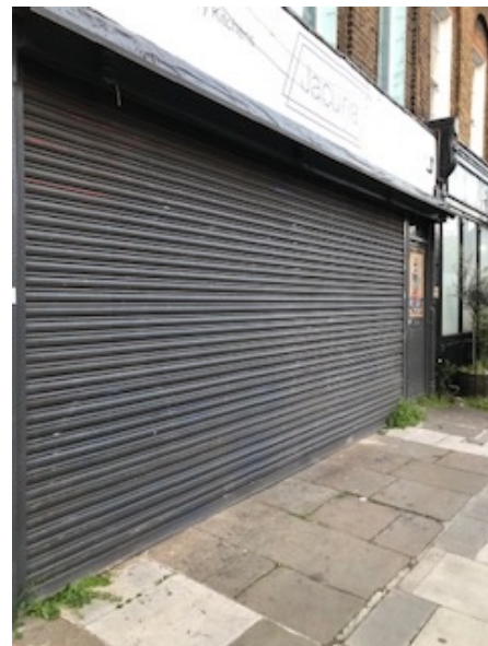
Photo 20. Front office closed.