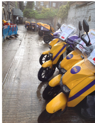
Photo 17. Close up of Getir parking area.