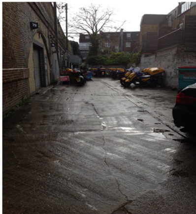
Photo 16. The rear carpark and Getir parking area.

I've attached some photos below and videos above.