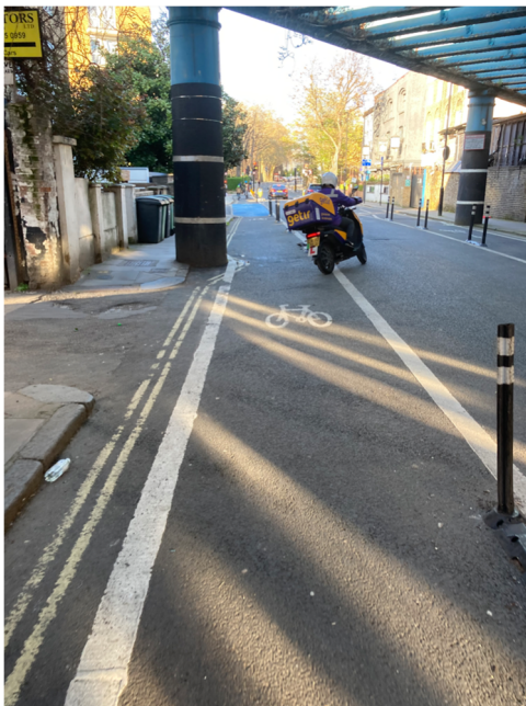
Photo 15. View of Getir rider on electric scooter exiting the shared lane onto Randolph Street.