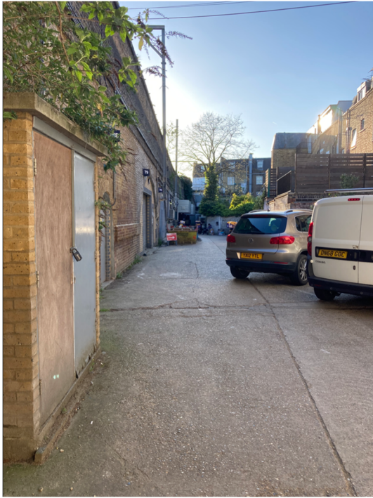
Photo 10. View of rear lane showing some biodiversity.