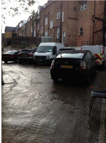
Photo 18. Six cars/vans parked in vehicle delivery turning zone.