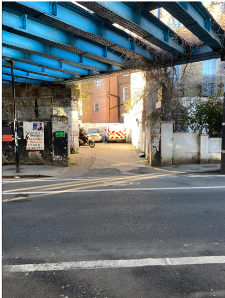
Photo 13. View of collection rider on moped existing rear lane. No marshal present.