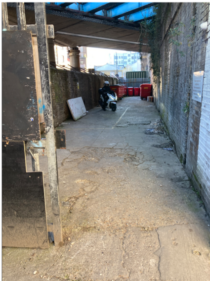
Photo 11. View of collection rider on moped using designated parking area. No marshal present. Note; the narrow gap allowing riders to pass through.