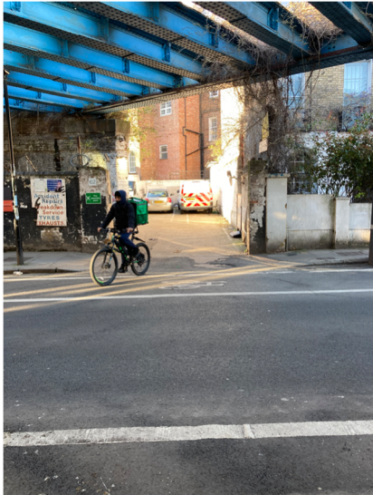
Photo 12. View of collection rider on bicycle leaving the site from rear lane on to Randolph Street. No marshal present.