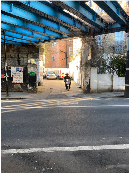
Photo 14. View of collection rider on moped about to leave site from rear lane on to Randolph Street. No Marshal present.