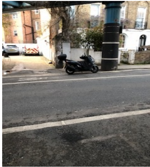
Photo 21. Bike parked in cycle lane.