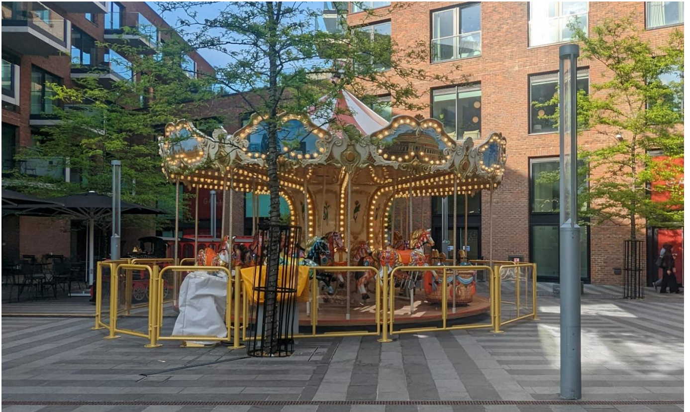
Site photos April 2023: