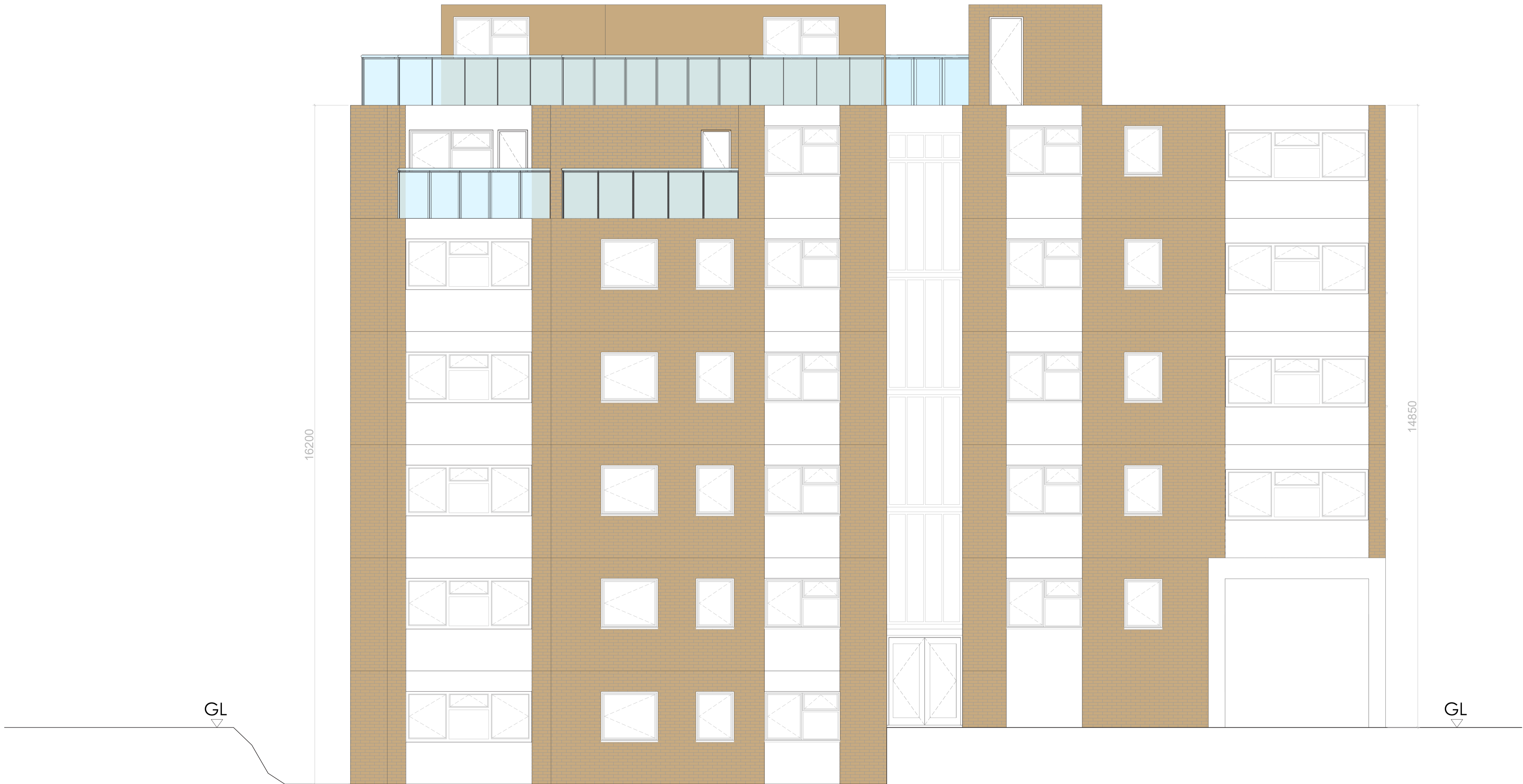
Proposed Elevation - East 1:50