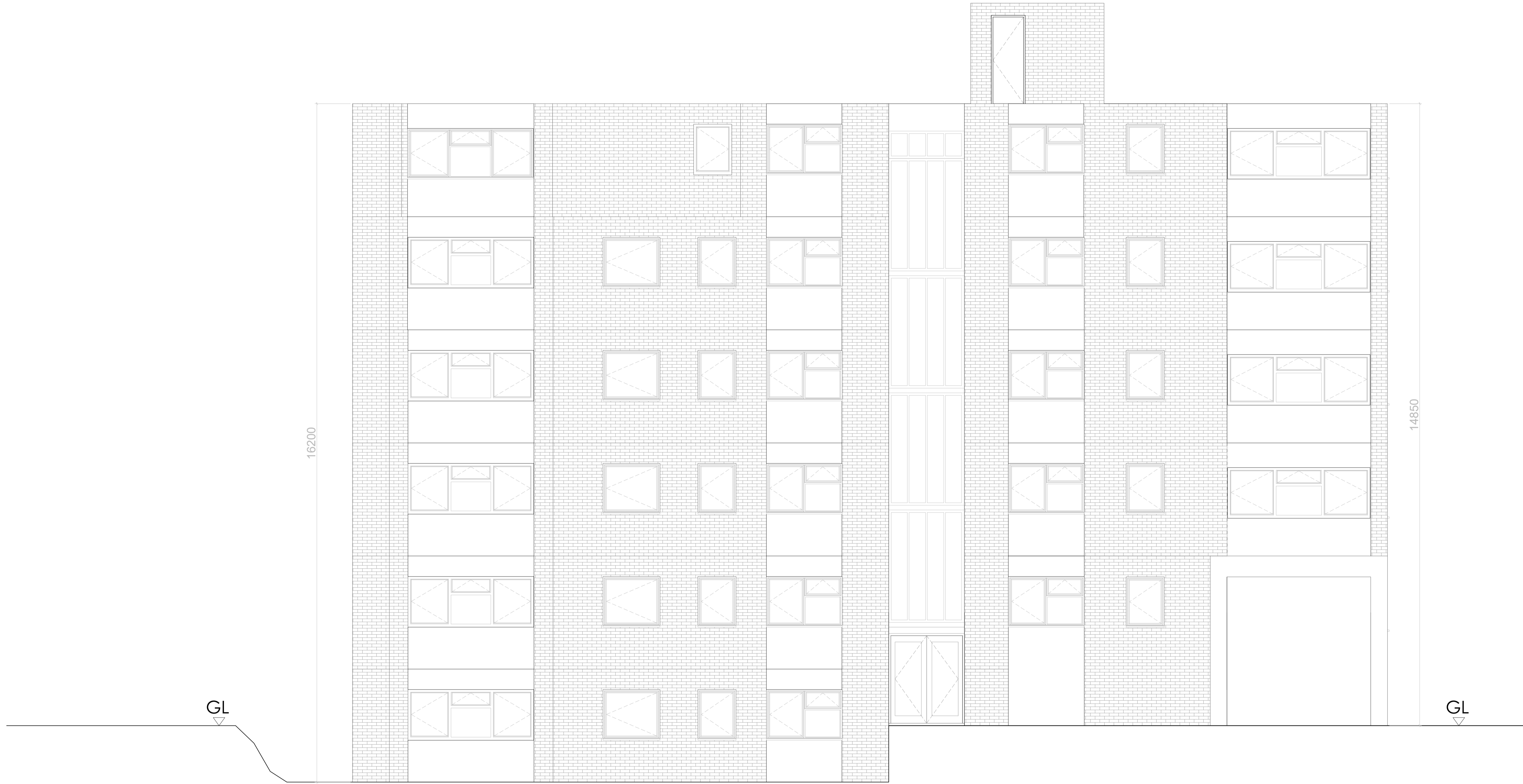
Existing Elevation - East 1:50