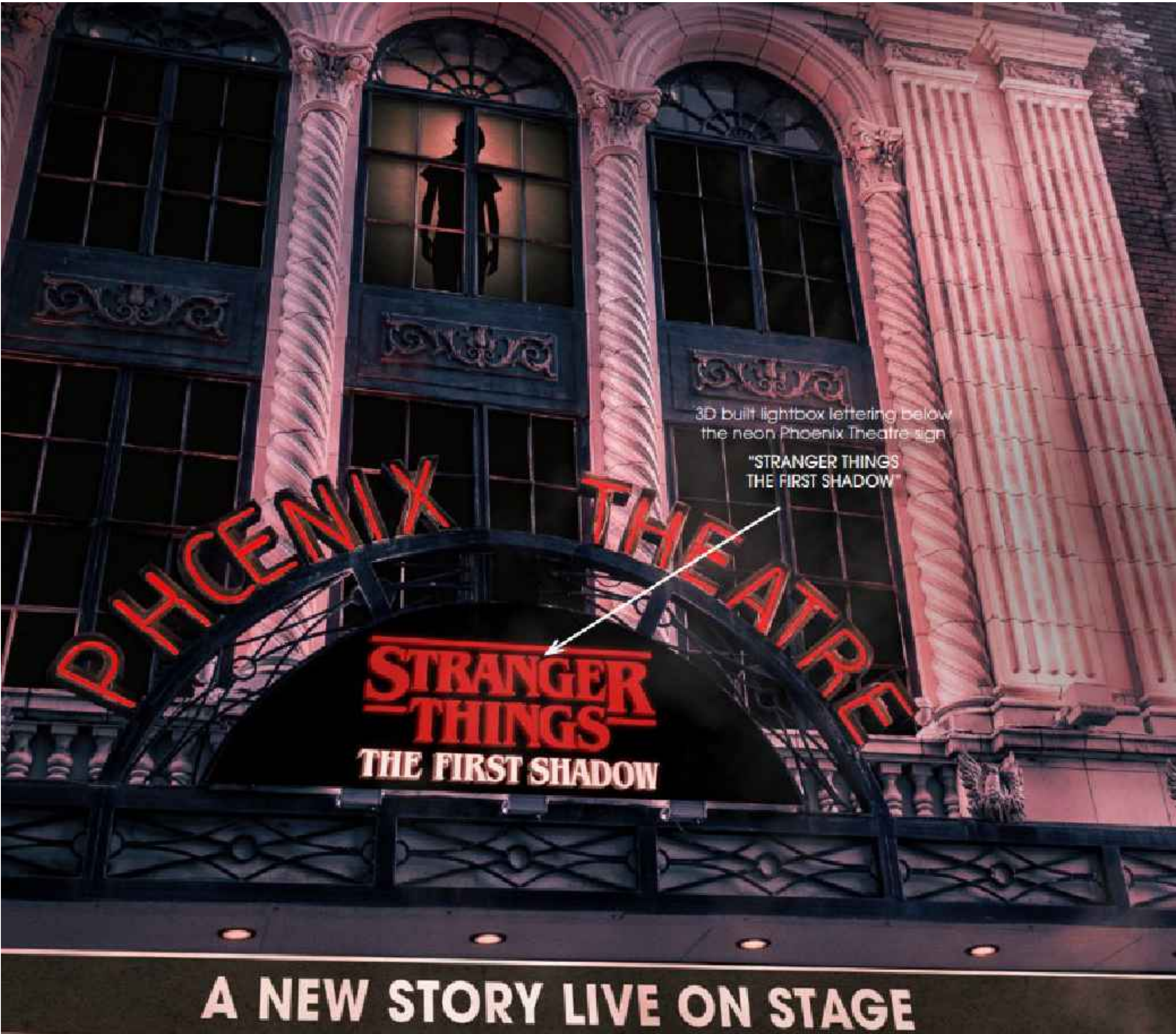
PROPOSED VISUALISATION OF CANOPY AND ABOVE TO SIDE ENTRANCE (NTS)