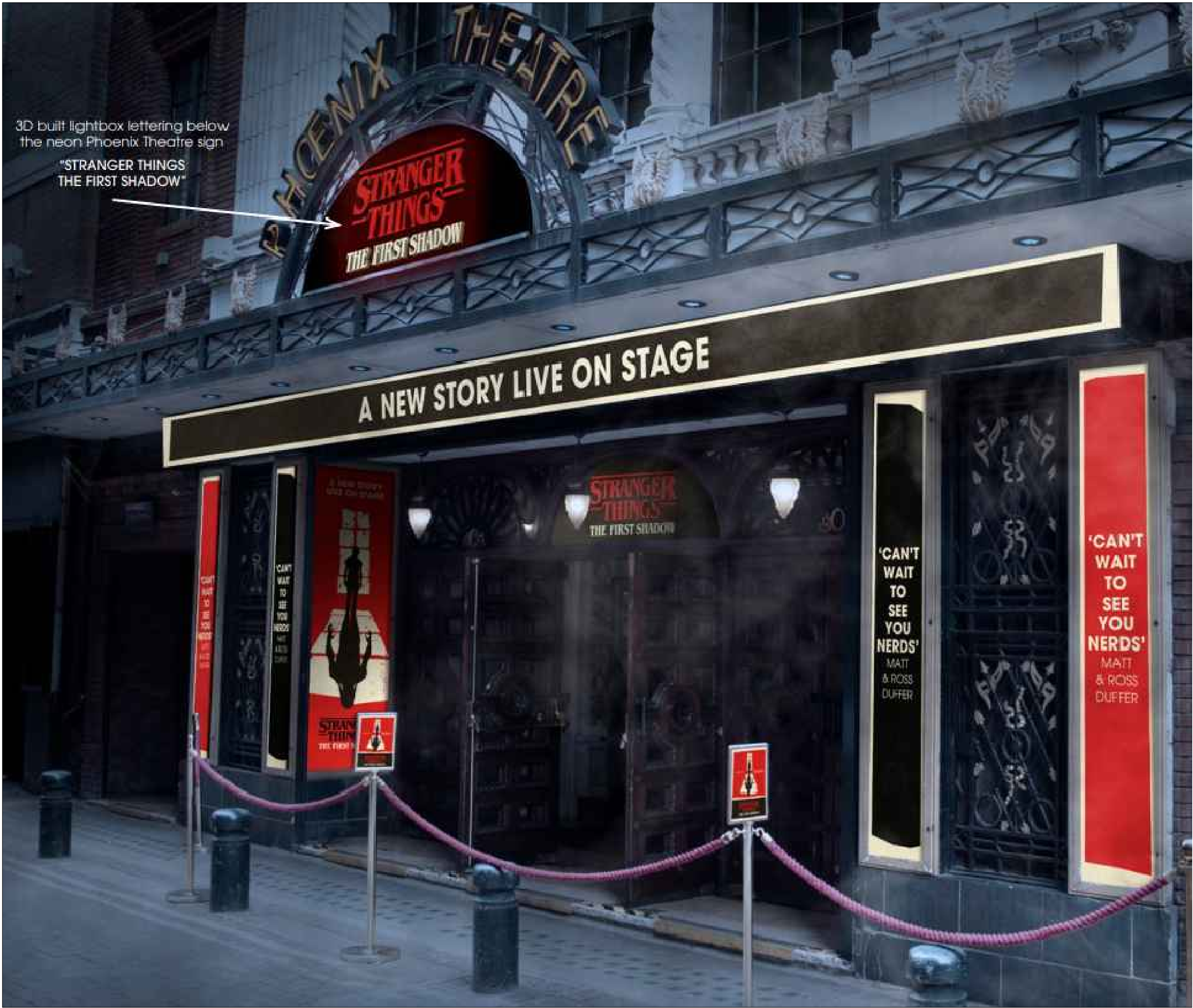
PROPOSED VISUALISATION OF SIDE ENTRANCE TO PHOENIX STREET (NTS)