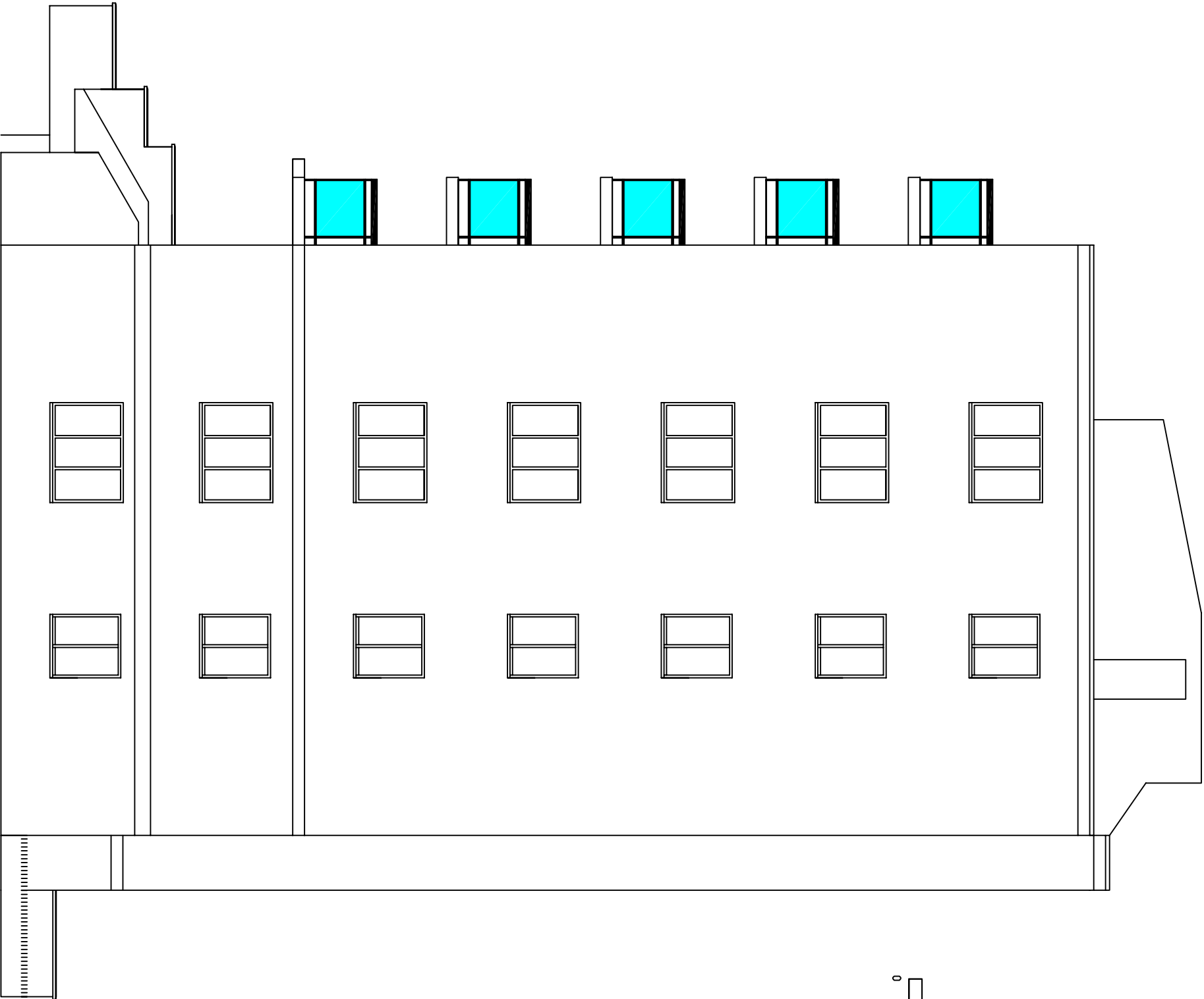
RH SIDE ELEVATION