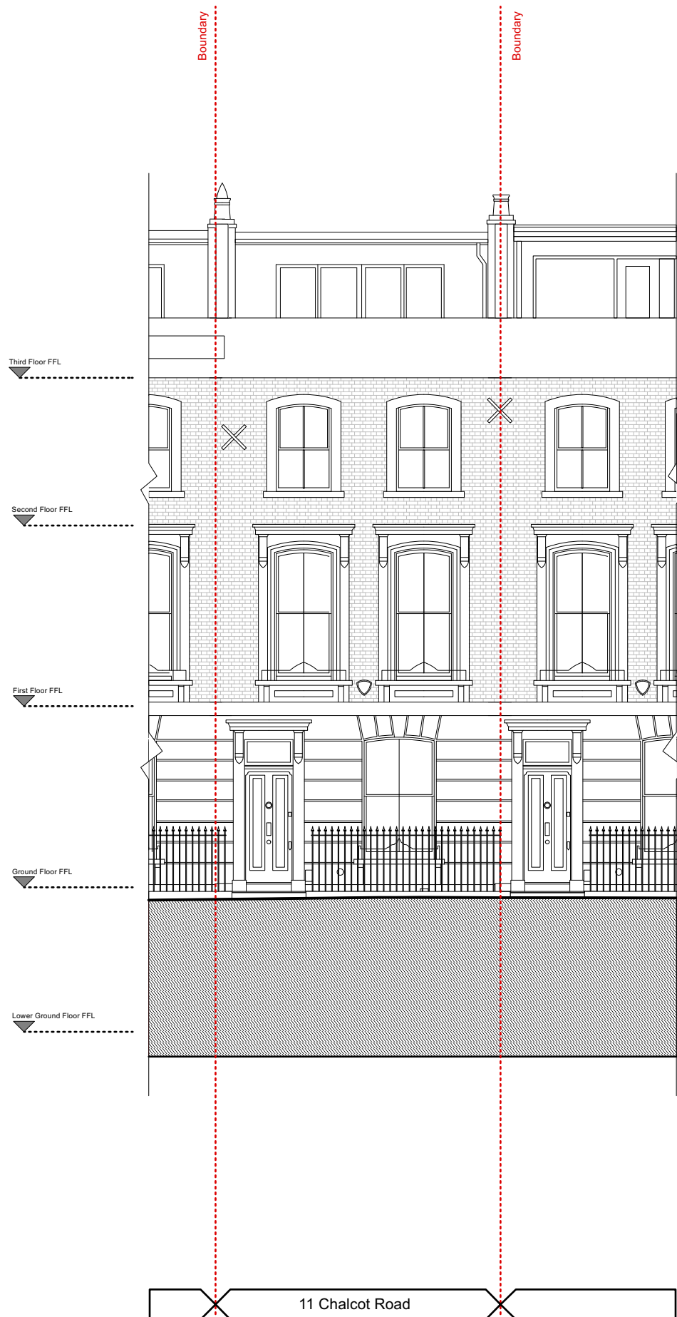
Front Elevation Existing Scale: 1:100