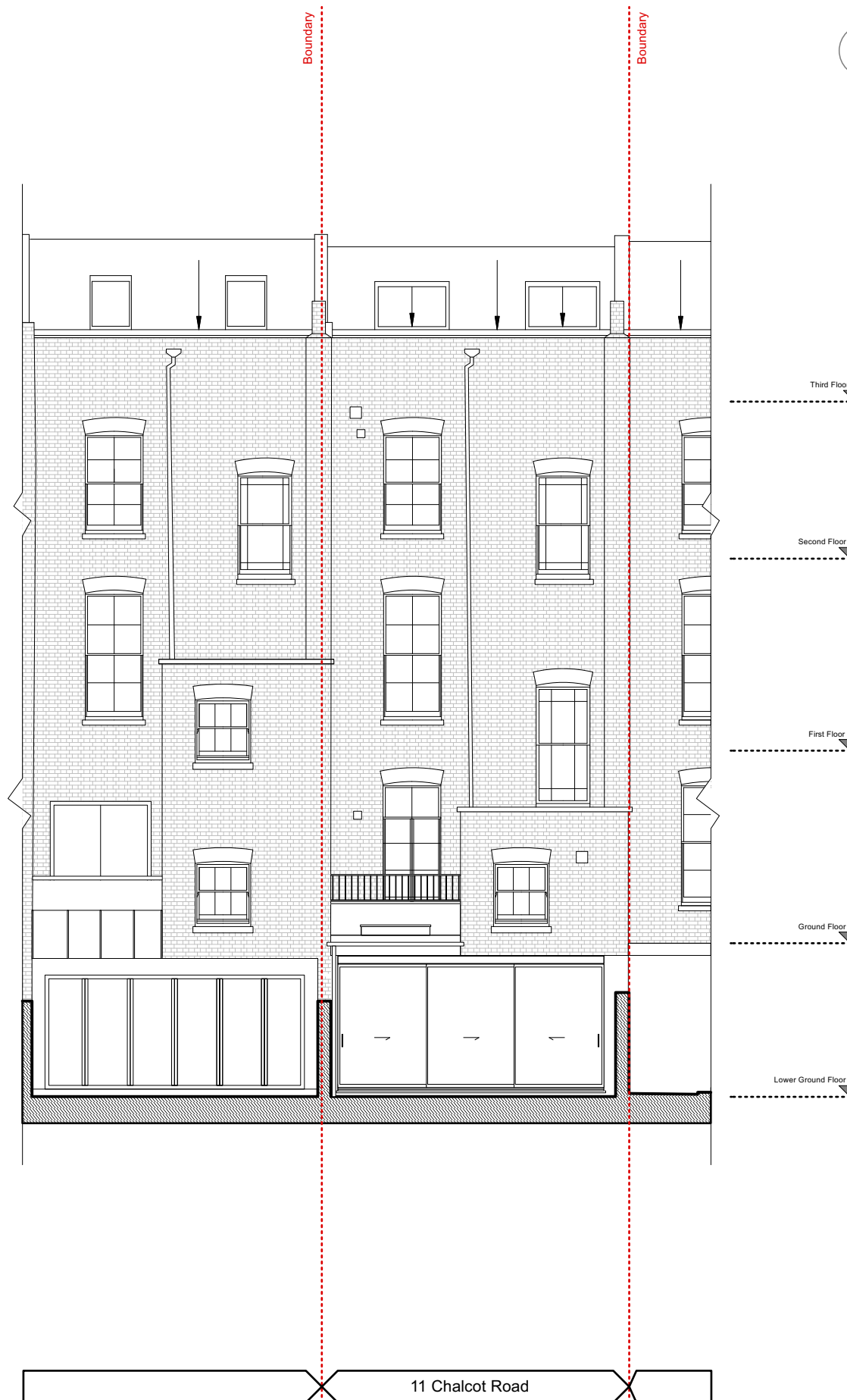
Rear Elevation Existing Scale: 1:100