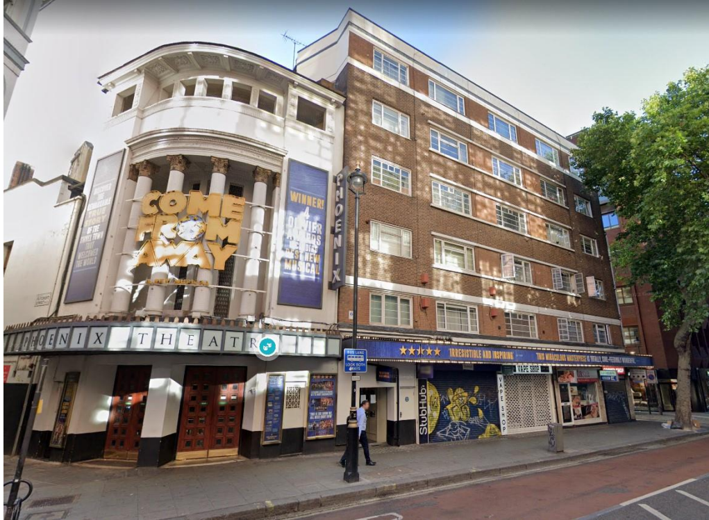
Existing main front elevation showing rotunda