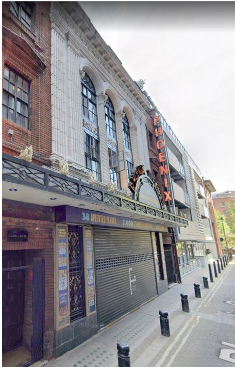
Existing Phoenix Street side elevation