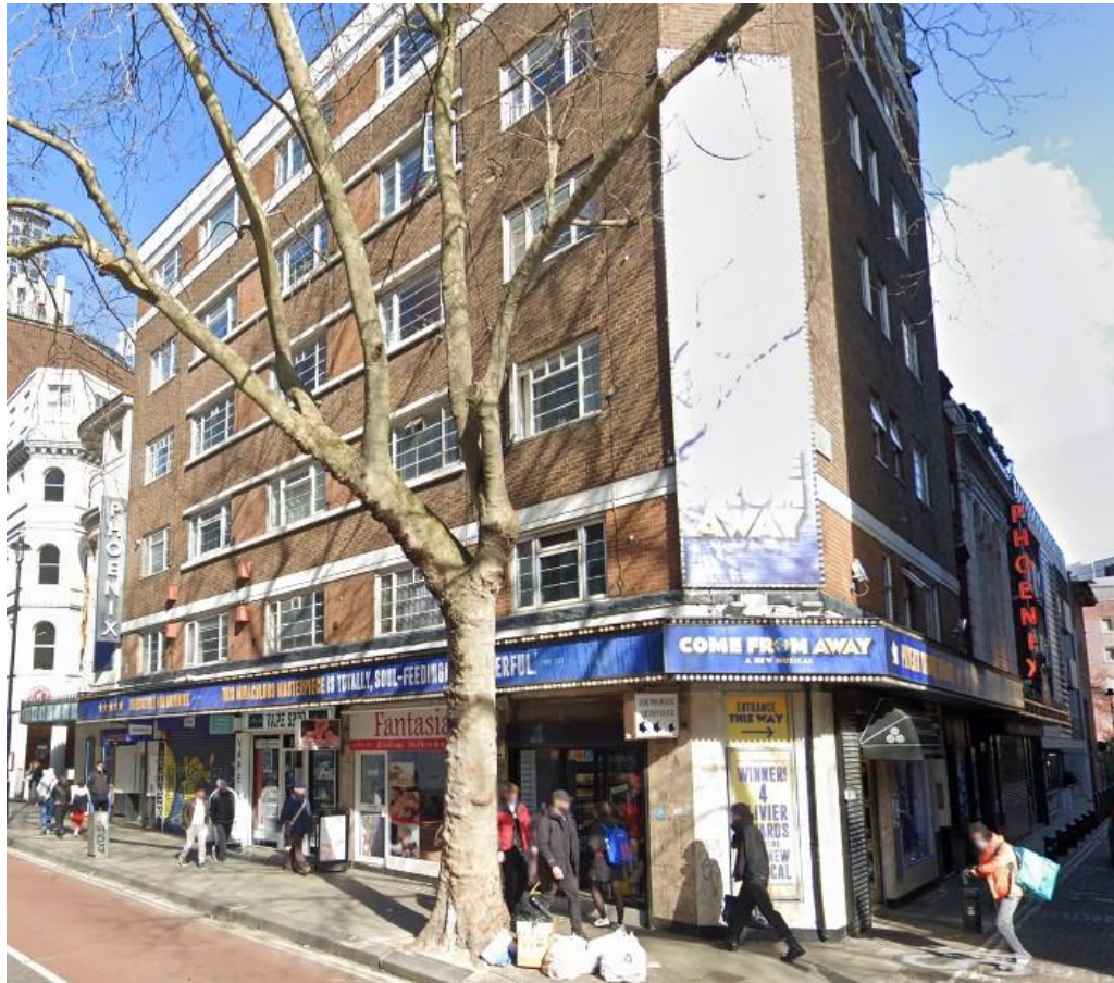
Existing Charing Cross Road elevation