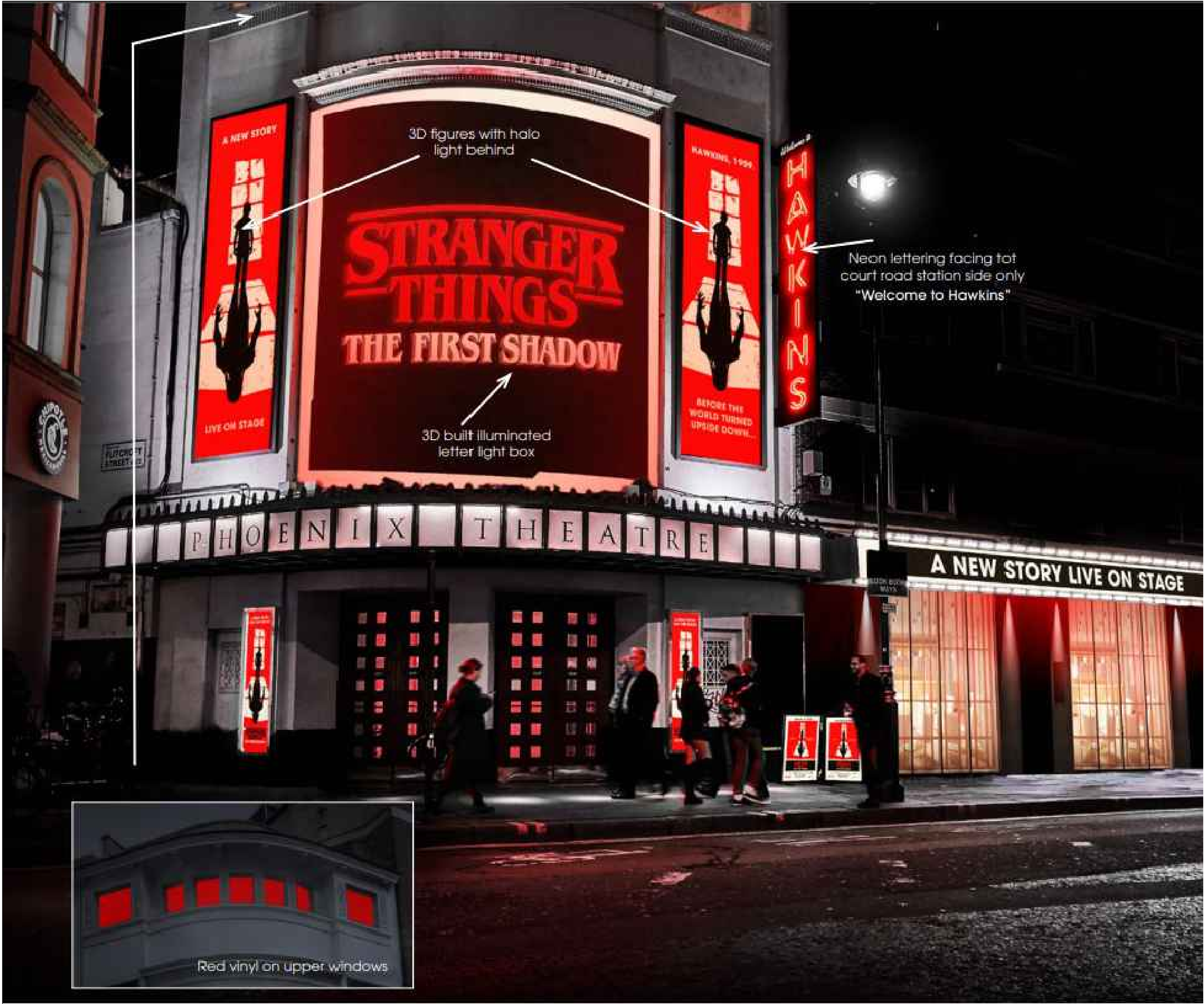
PROPOSED VISUALISATION OF ROTUNDA (NTS)