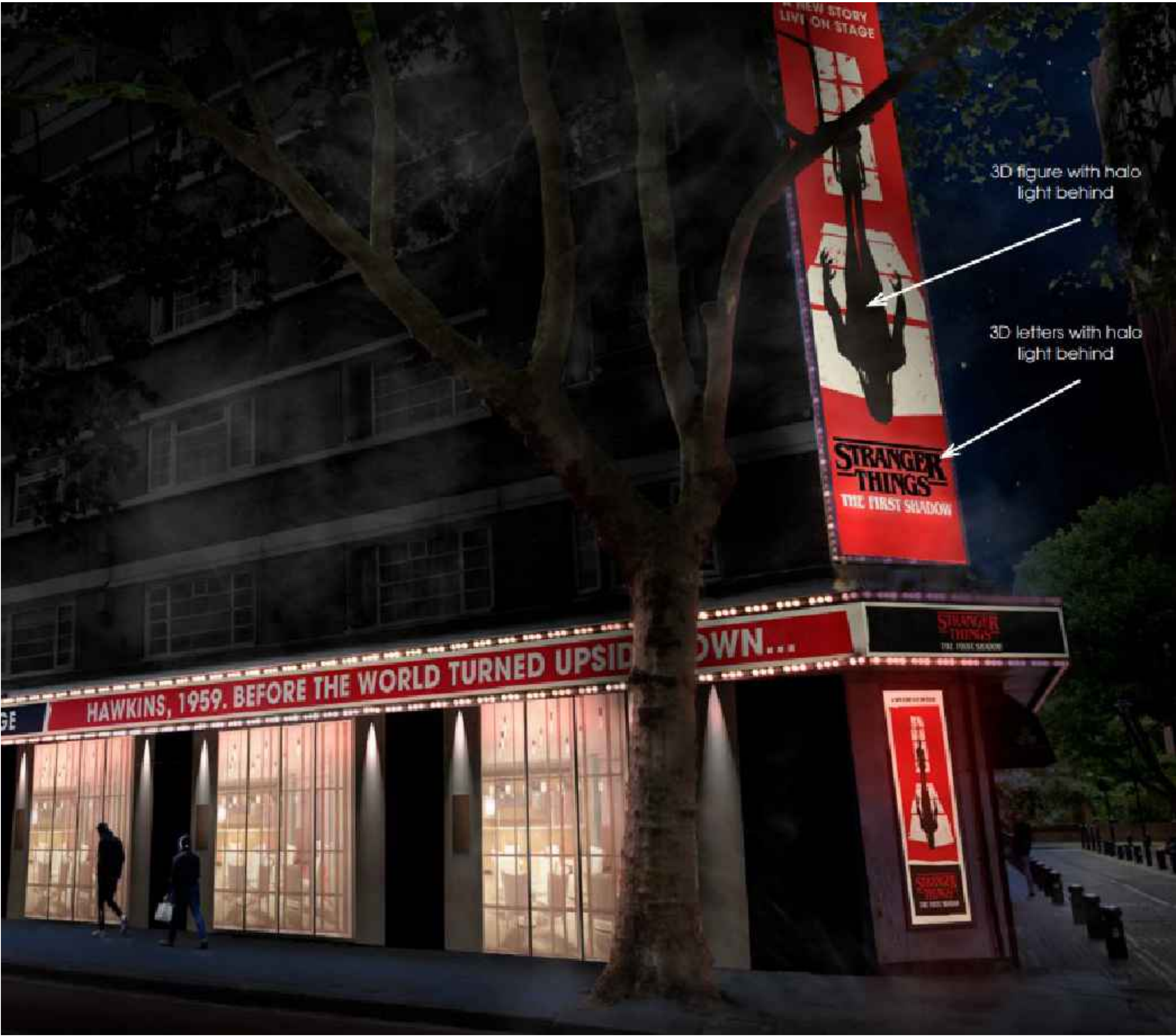
PROPOSED VISUALISATION OF CHARING CROSS ELEVATION (NTS)