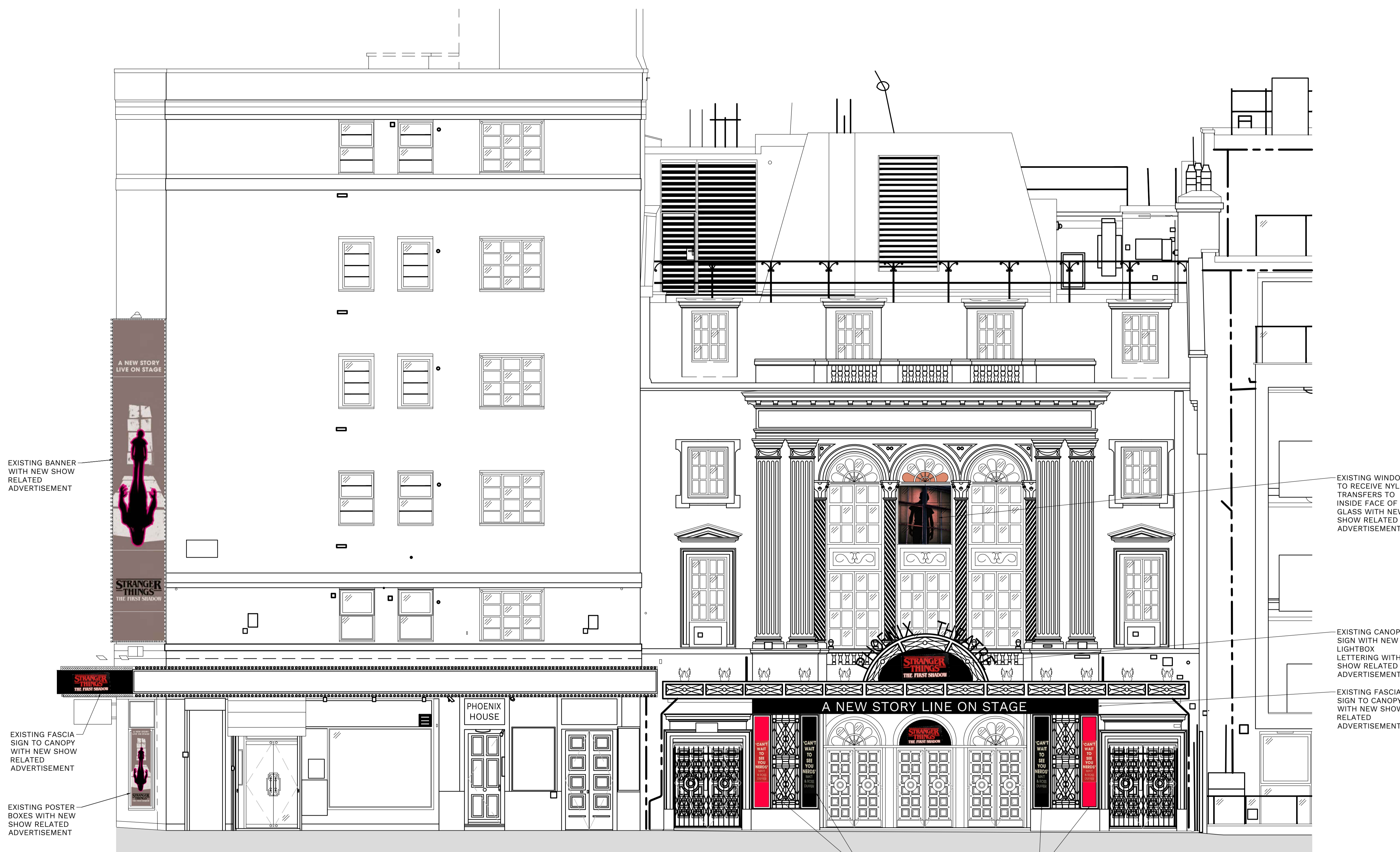
PROPOSED PHOENIX STREET ELEVATION (SCALE 1:50 AT A1)