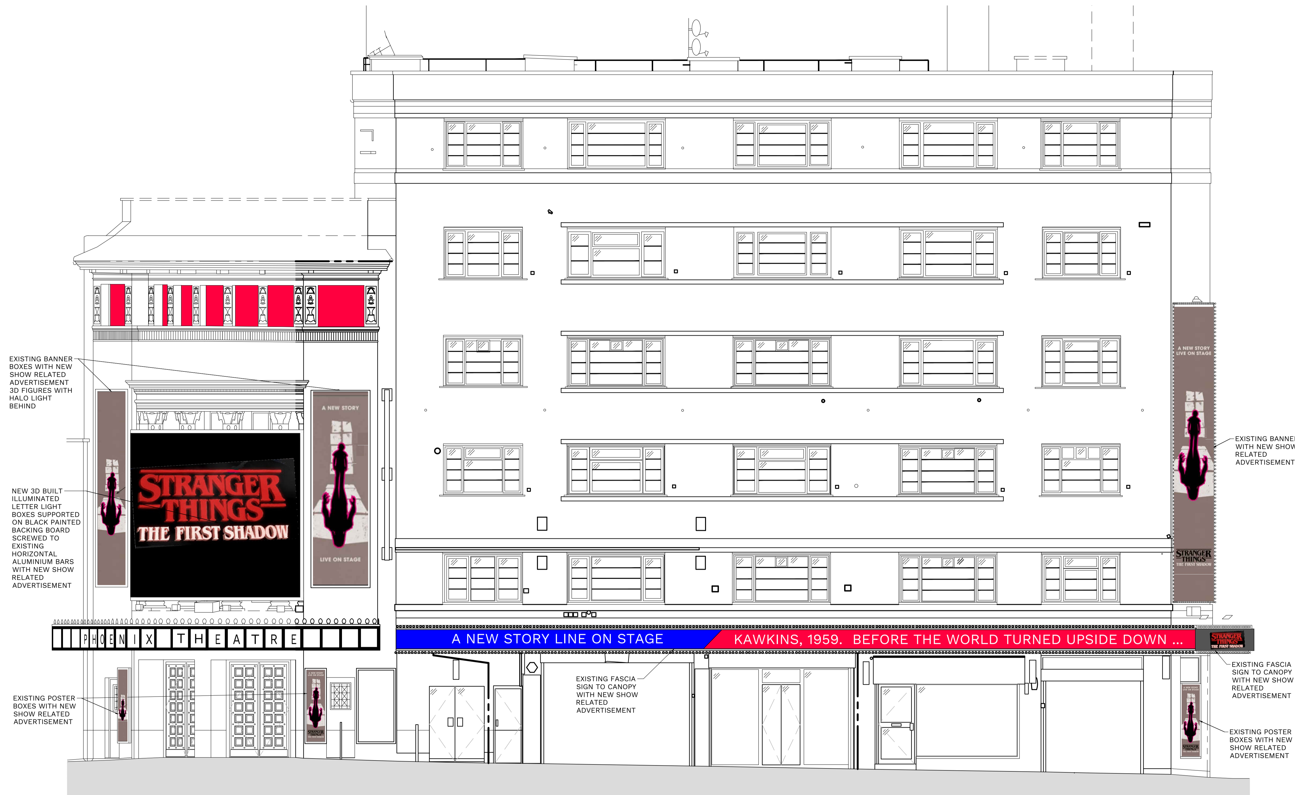
PROPOSED CHARING CROSS ROAD ELEVATION (SCALE 1:50 AT A1)