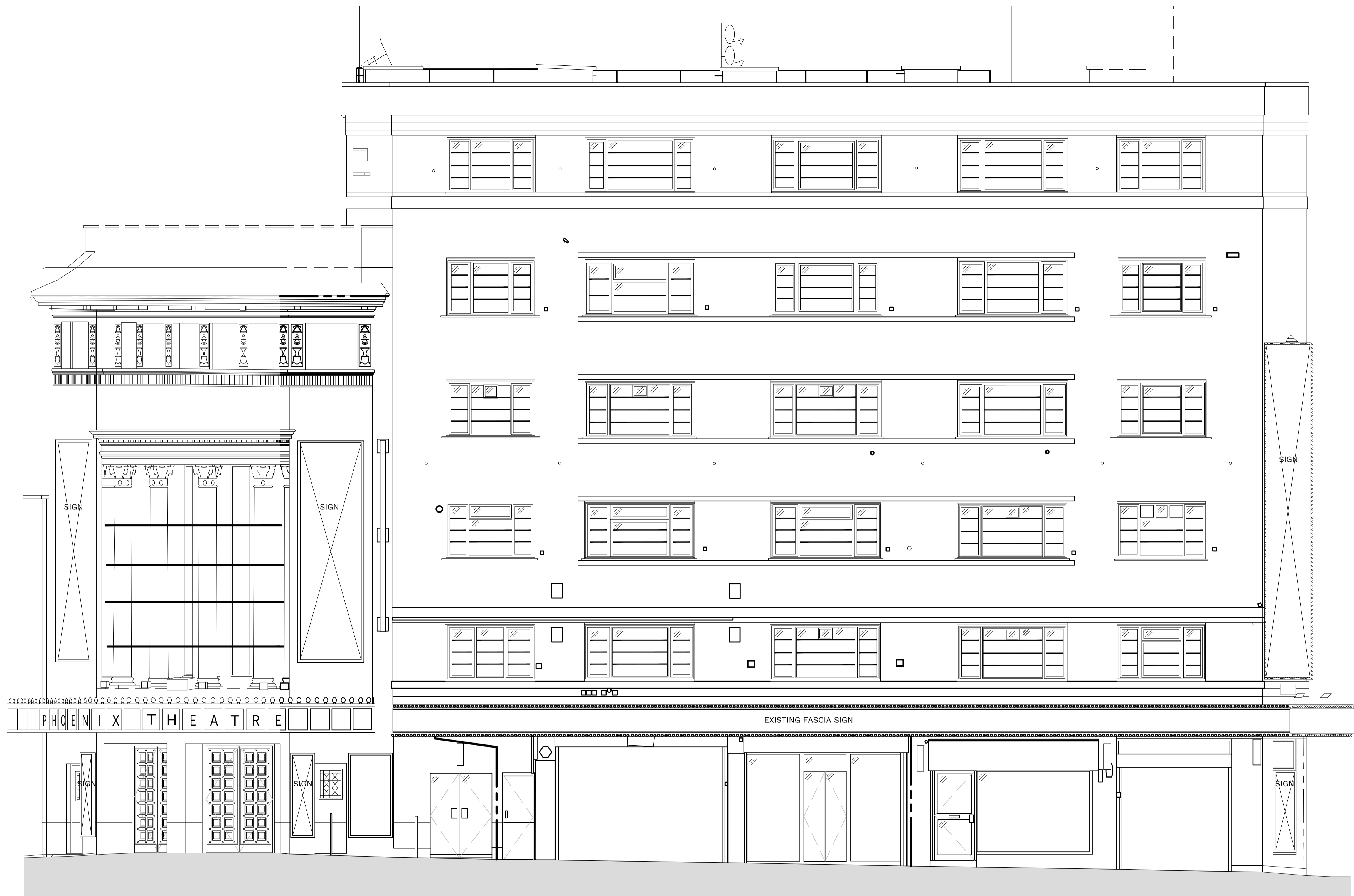
EXISTING CHARING CROSS ROAD ELEVATION (SCALE 1:50 AT A1)