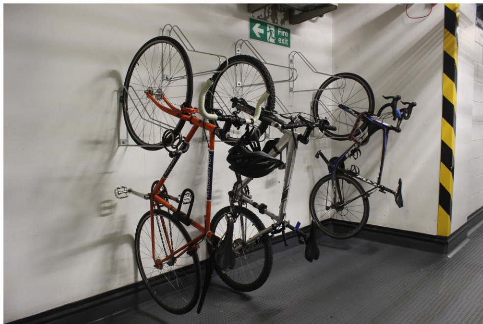
Proposed bike storage method

Wall mounted bike storage is preferred to maximise the amount of storage and to make best use of the floor plan of the entrance lobby. Bikes will be able to be locked securely to the wall hung racks for added security.