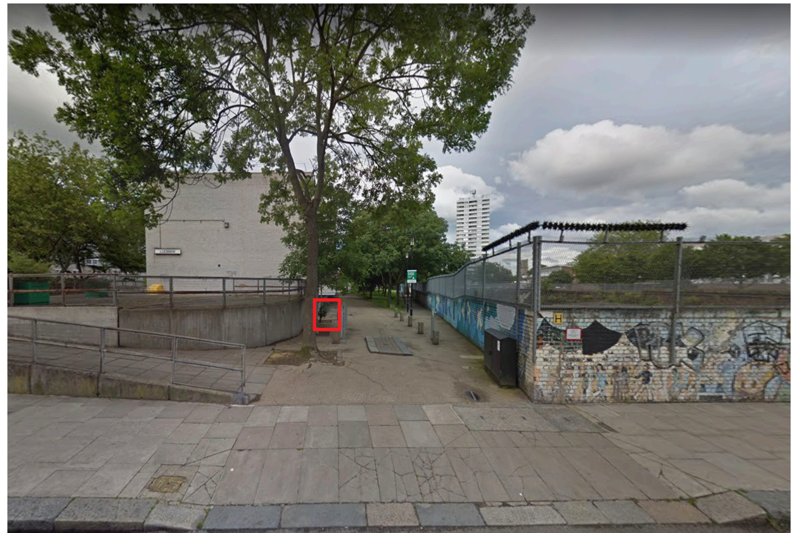
Proposed bin store location outside main entrance of Mosaic School to be used for 2no. new 1100L eurobins which will provide more than double the existing site capacity. Location approved and recommended by Veolia Waste.

Residential bins should be stored in the existing internal bin stores, and not within the Undercroft studio spaces.