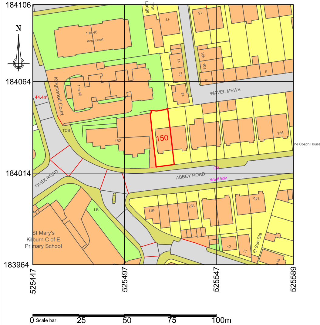
Site plan proposed 1:500