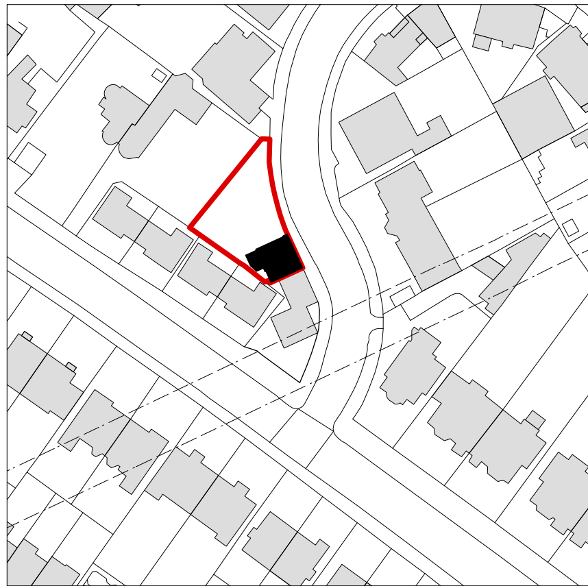
0 12.5 25 METRES EXISTING SITE LOCATION PLAN @ 1:1250