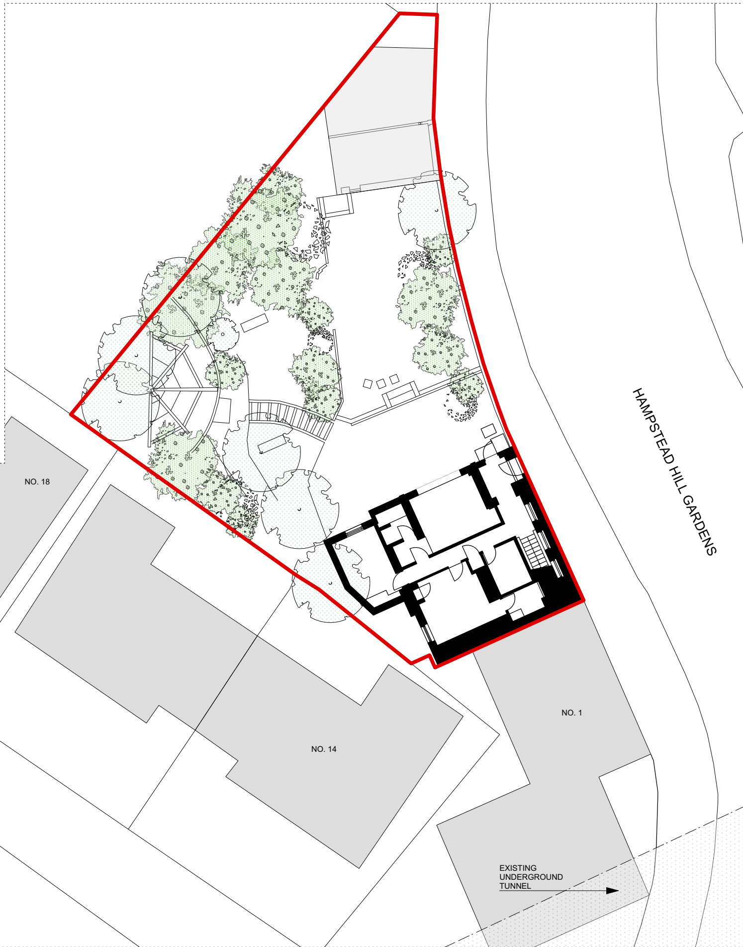
0 2 4 6 8 METRES EXISTING SITE PLAN @ 1:200