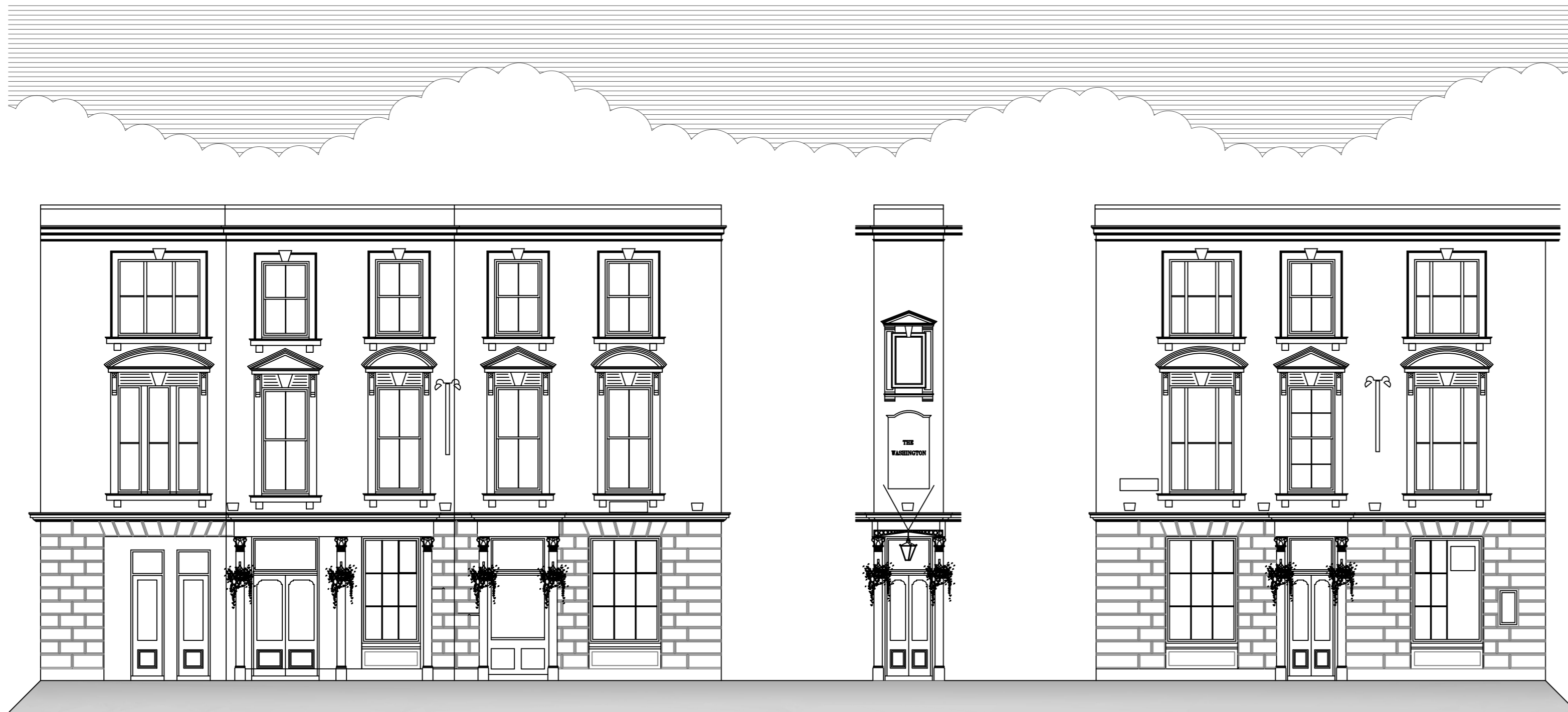
Belsize Park Garden Elevation 1:50