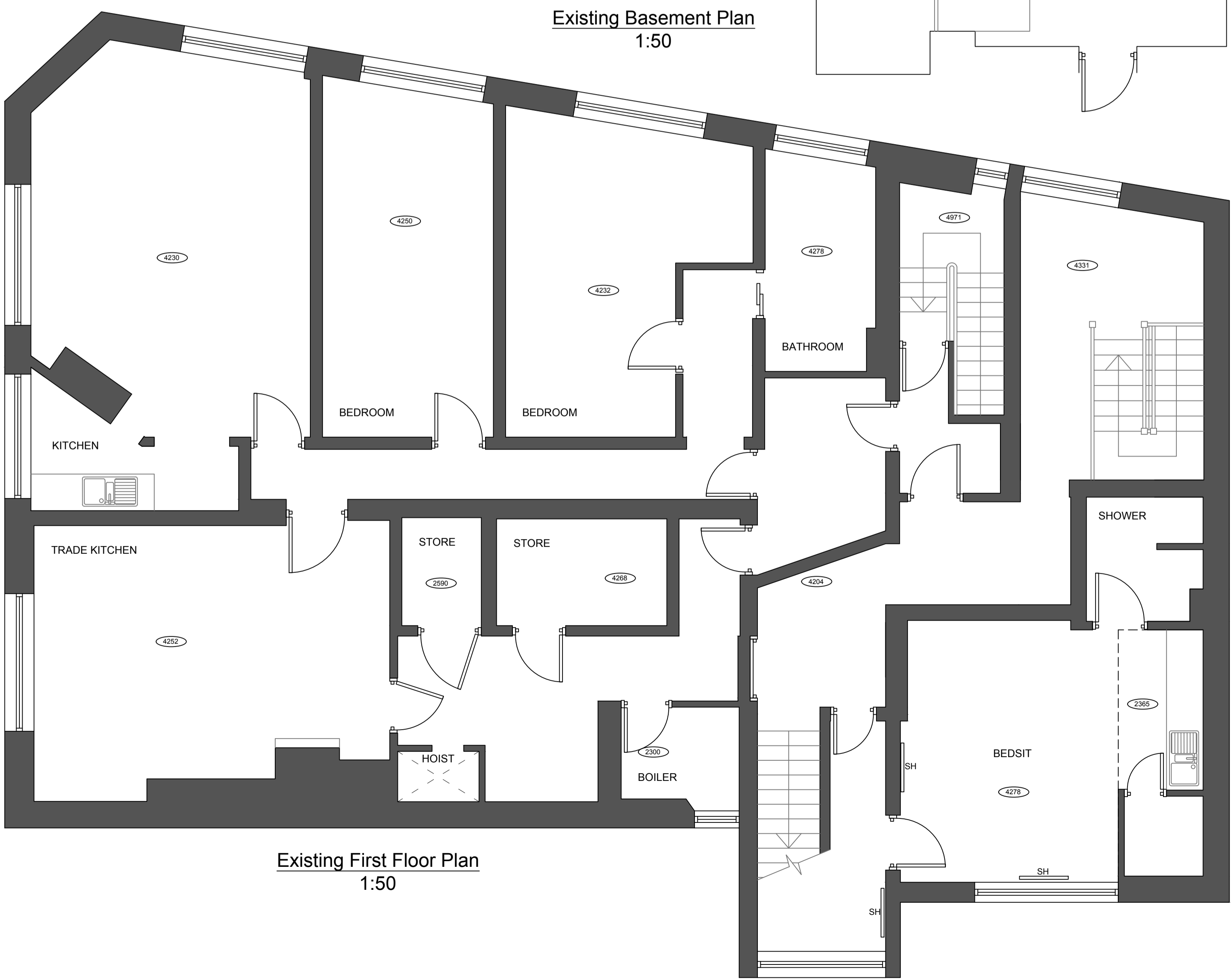
Existing First Floor Plan 1:50