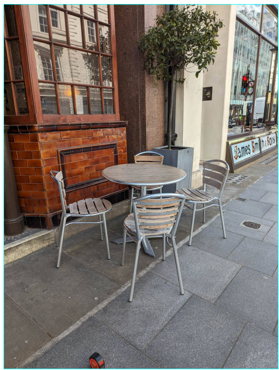
SEATING TO FRONT