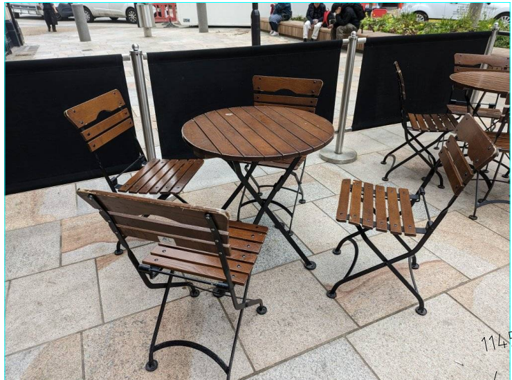
SEATING TO REAR AND BARRIERS