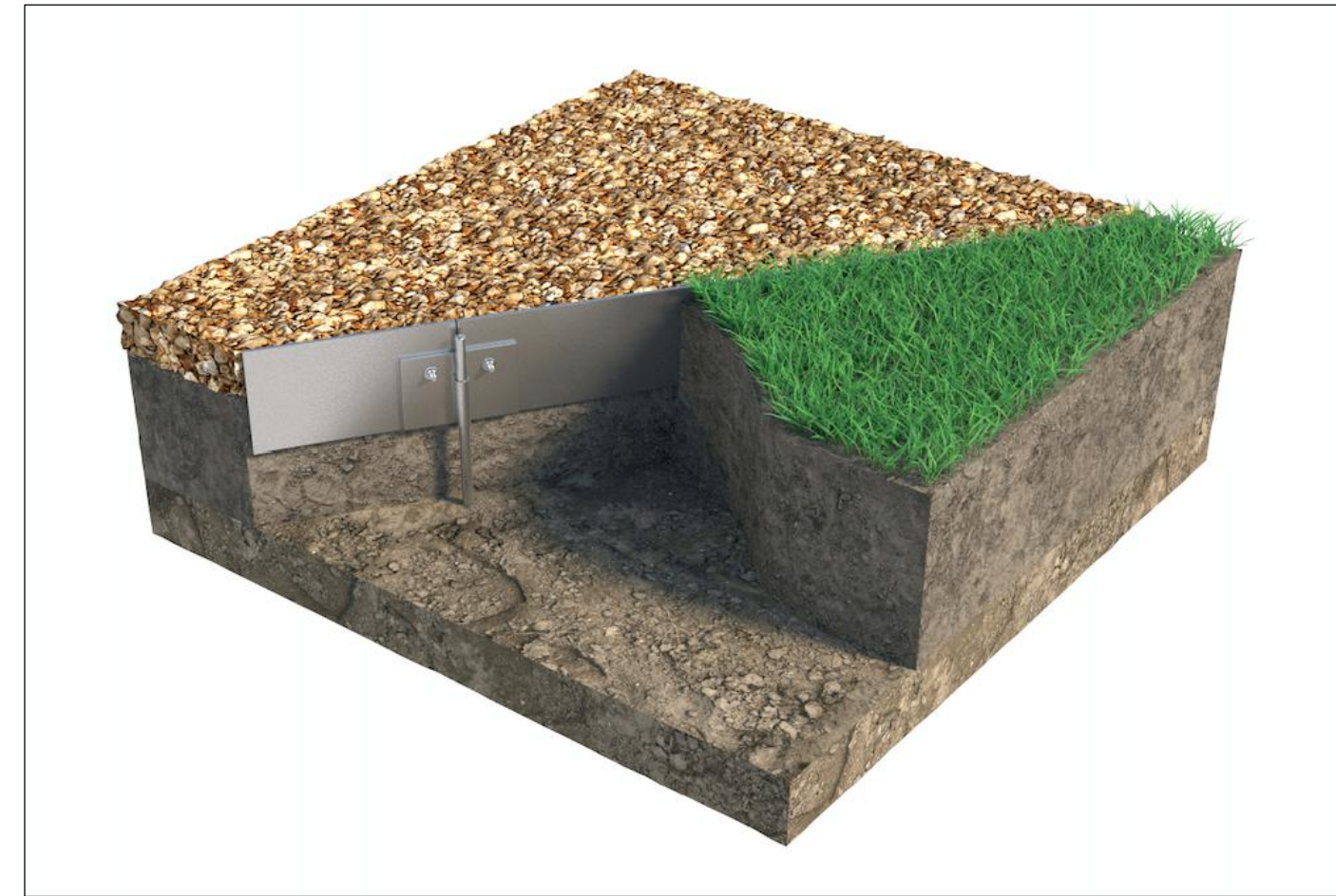
4 Illustration : Typical steel edge by Kinley NTS