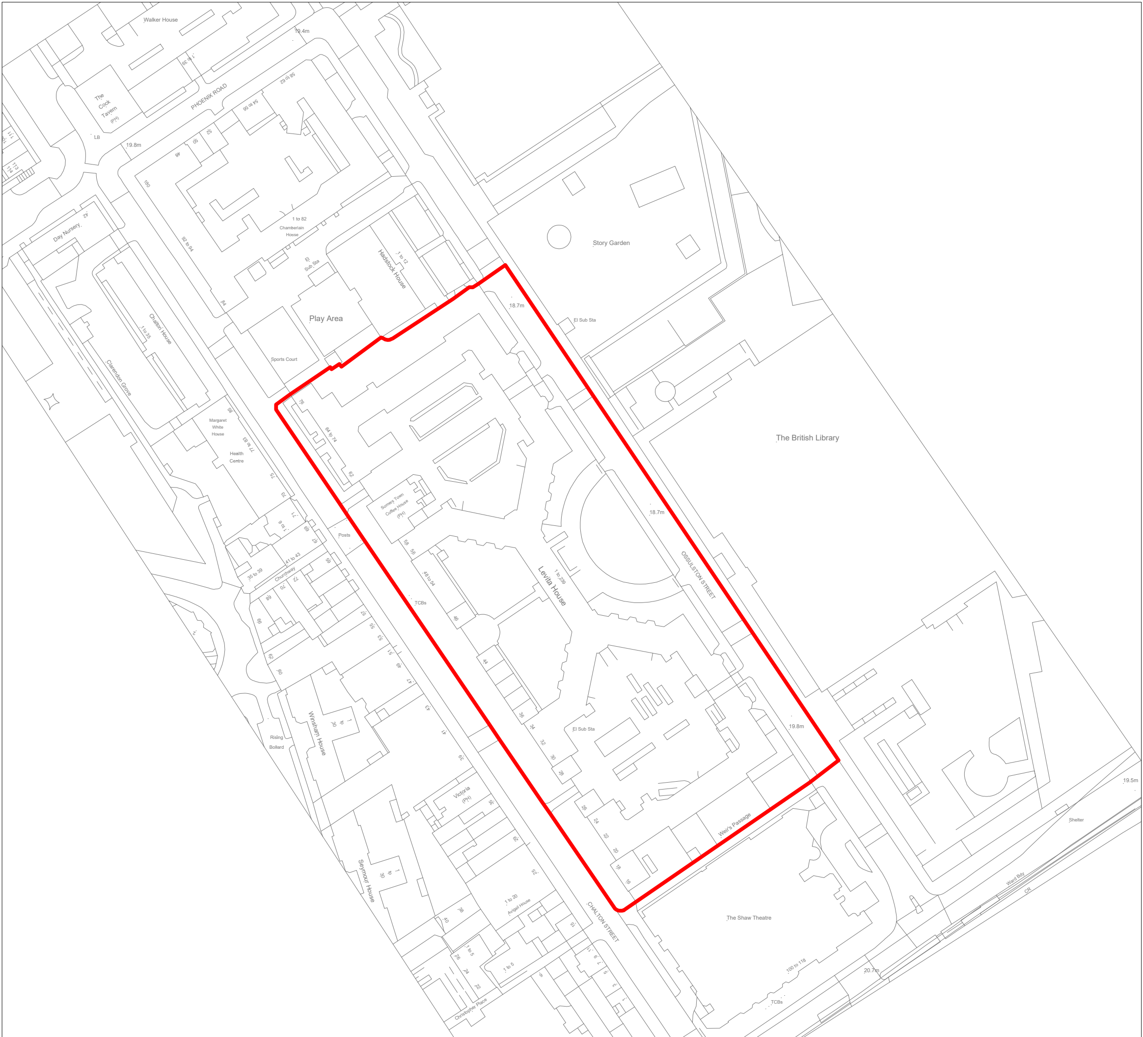
Site Plan - Scale 1:1250