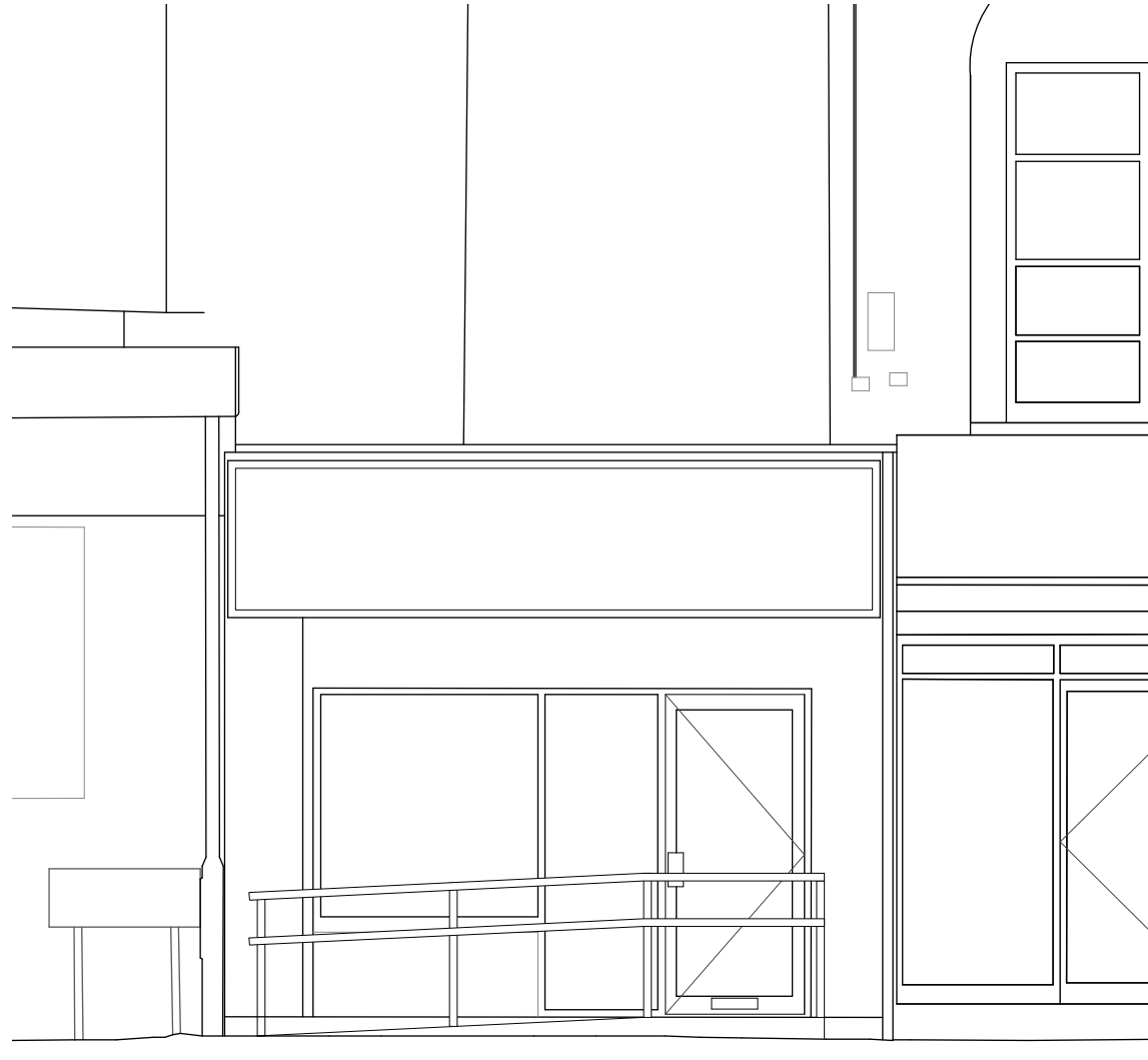
Existing front elevation 1:50 @ A3