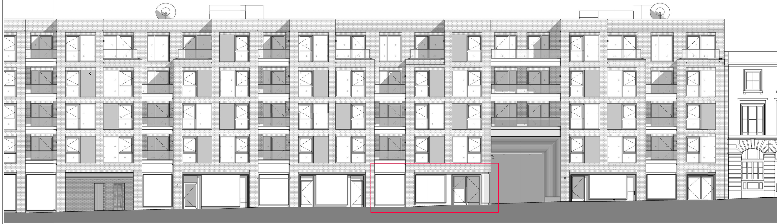
North West Elevation As Existing Babylon Park