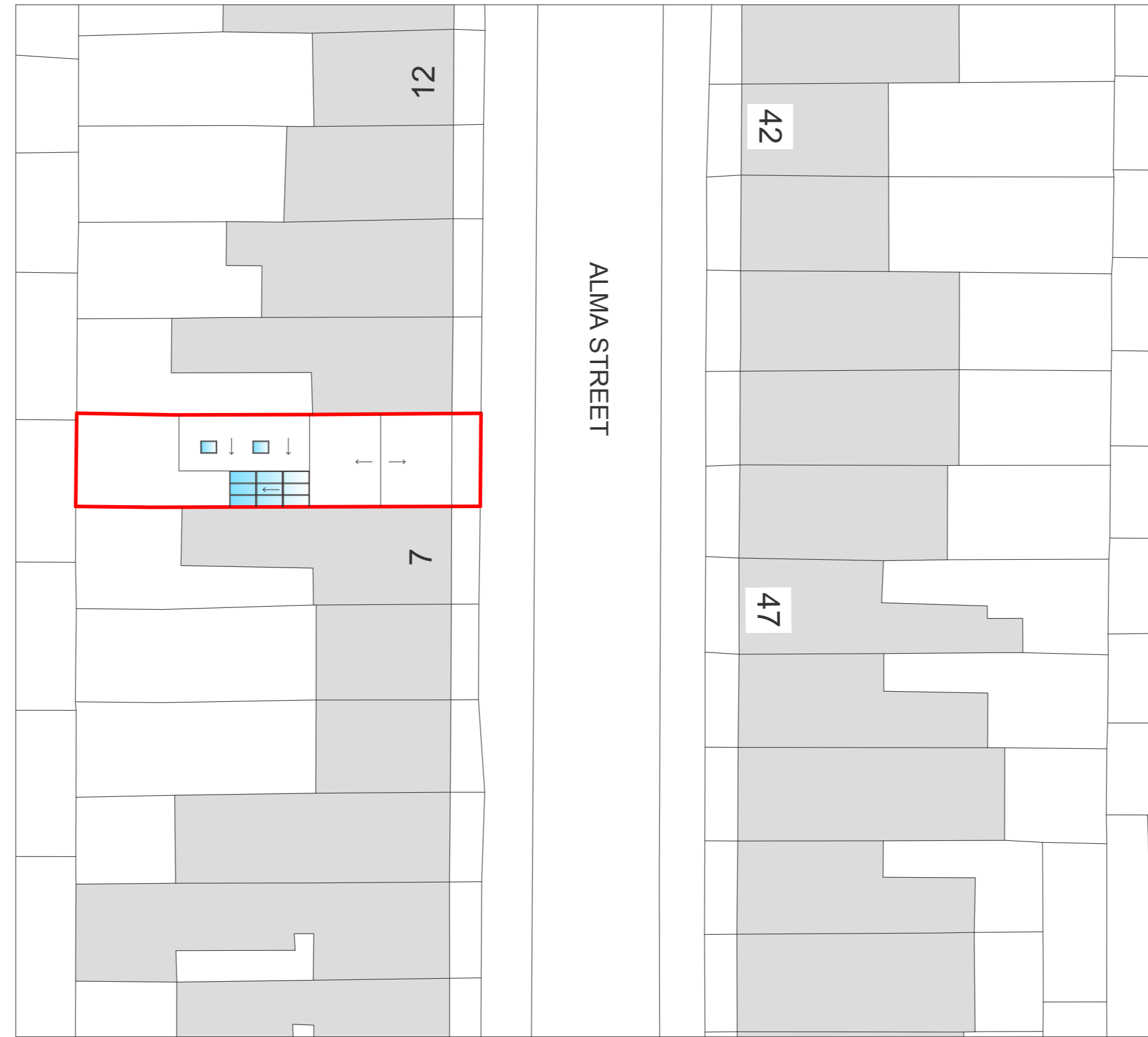
02 Site plan Scale 1:250