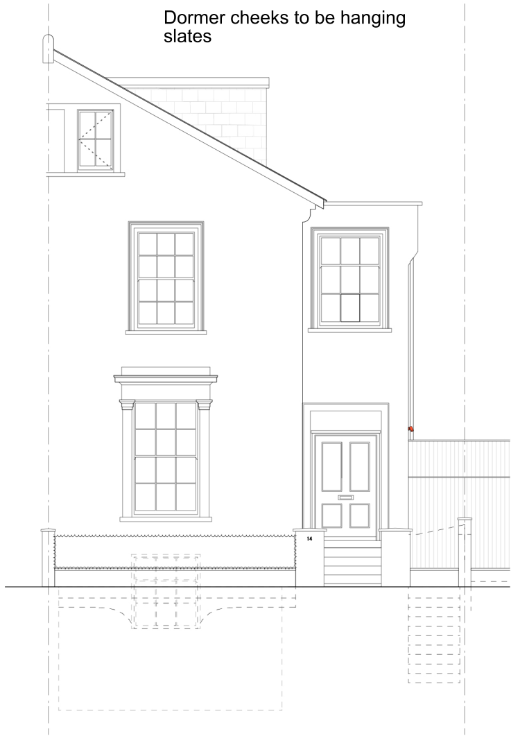
Front / Street Elevation