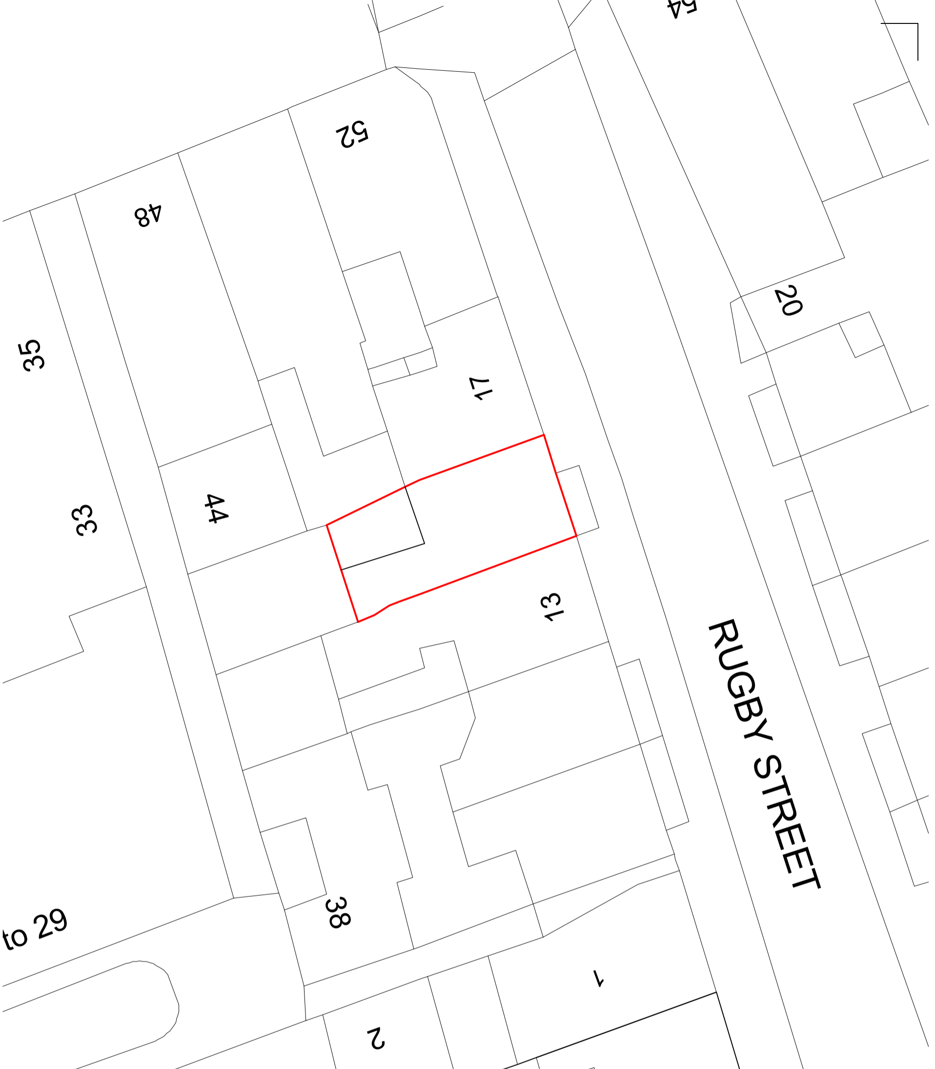
BLOCK PLAN (1/200@A3)