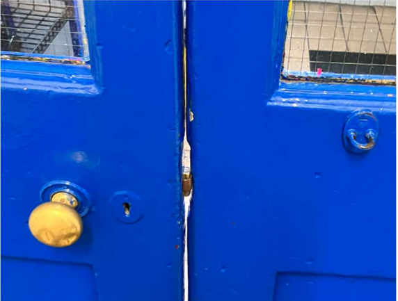
Figures 2 and 3: non fire rated glazing to be replaced & Damage to door leaf allowing passage of flames/smoke