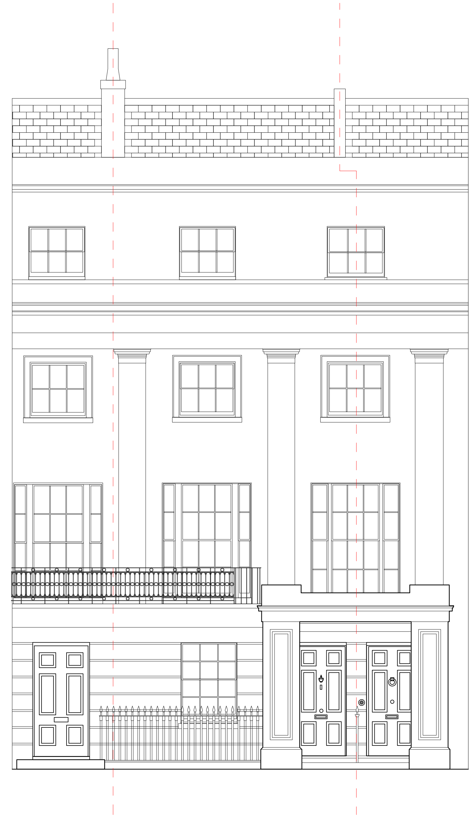
02 FRONT ELEVATION 1:50 @ A1