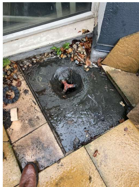
Figure 3: Roof build-up beneath paving