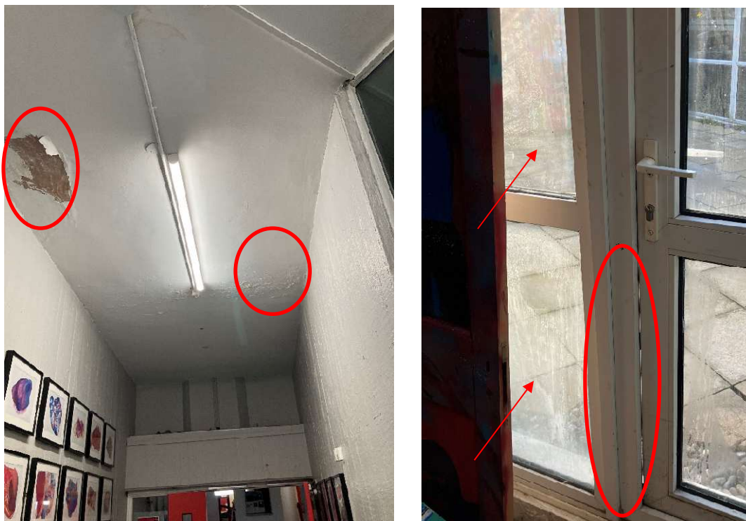
Figures 4 and 5: A sample of internal leaks to ceiling below, due to poor roof detailing (left). A sample of defective, life expired glazing. Bowing door which does not close flush, and blown seals with condensation between panes (right).

Acland Burghley School, 93 Burghley Road, London, NW5 1UJ