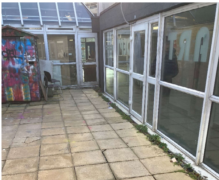
Figure 2: Overview of roof terrace and glazed area