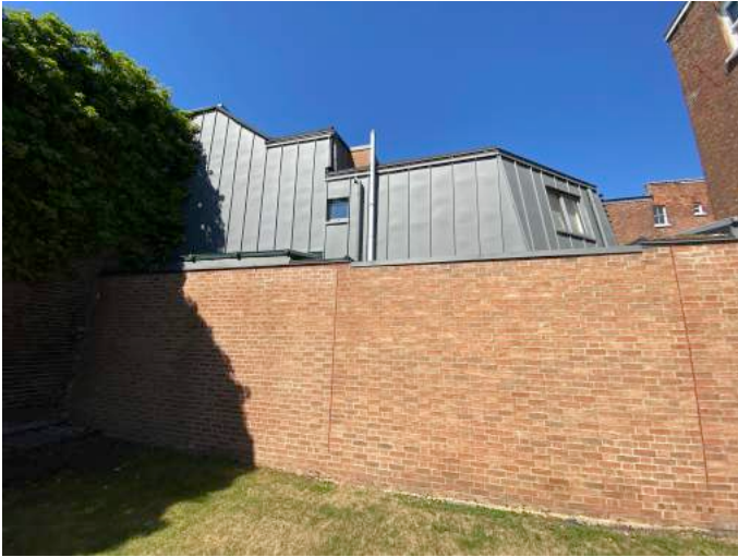
VIEW OF ADJACENT BRICK WALL AND NEIGHBOURING PROPERTY