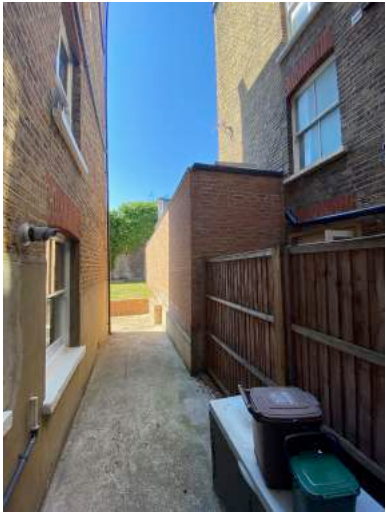
VIEW OF SIDE PASSAGE & TIMBER FENCE