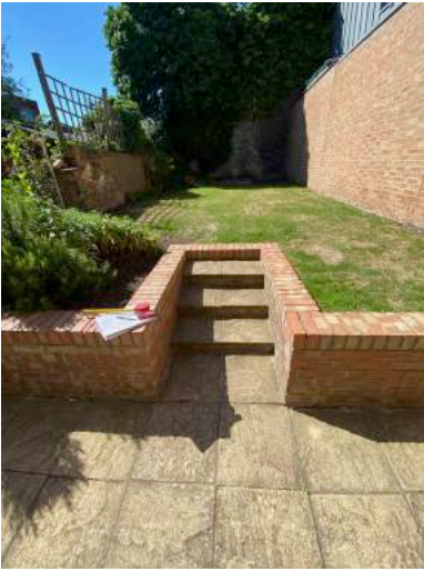
VIEW OF GARDEN FROM GARDEN DOORS