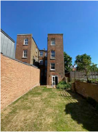
VIEW OF REAR ELEVATION FROM GARDEN