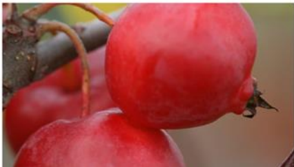
Malus × robusta 'Red Sentinel' crab apple ( syn. Malus 'Red Sentinel' )

Malus and Crataegus trees also provide food for birds during winter times.