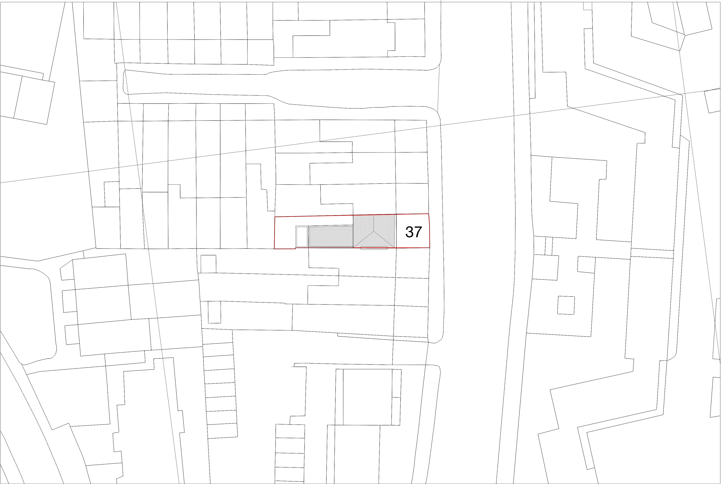
01 Block plan