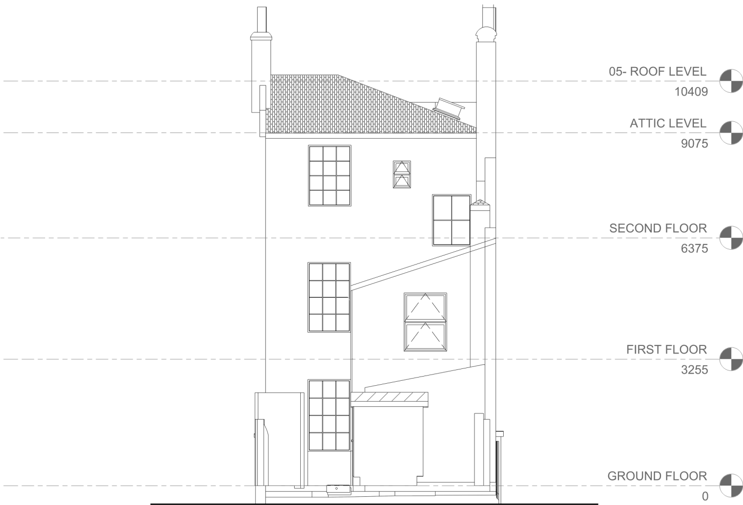
02Rear elevation 1:100