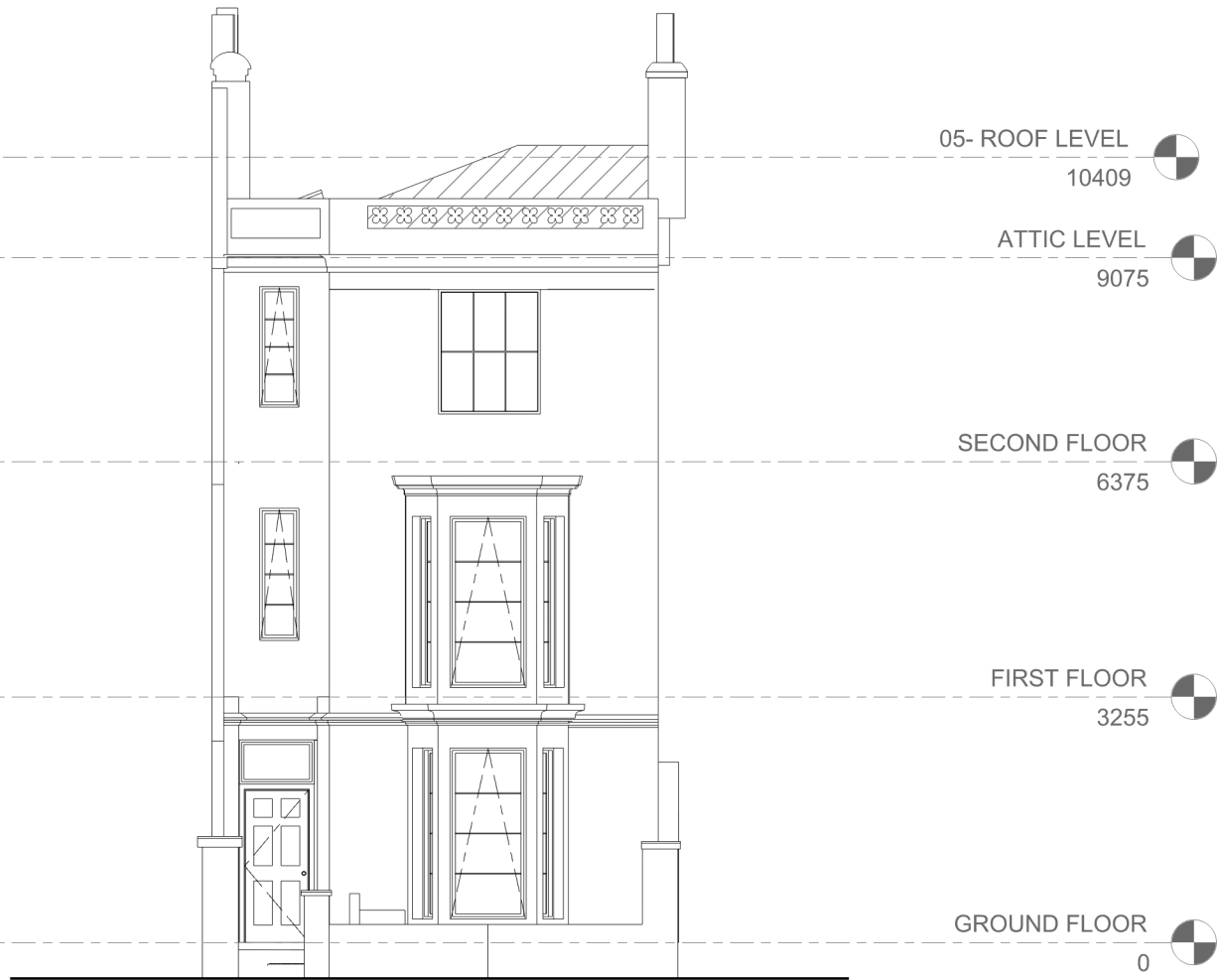
01Front elevation 1:100