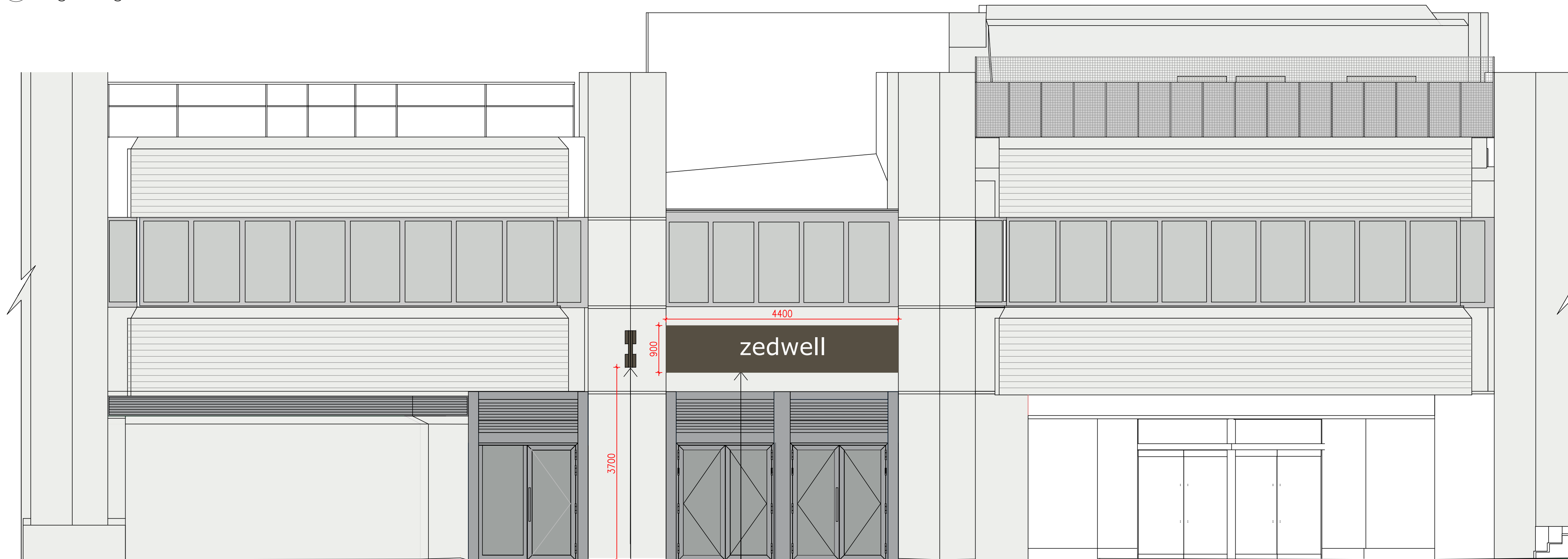
5 Elevation on Great Russell Street 1:50 @ A1 1:100 @ A3