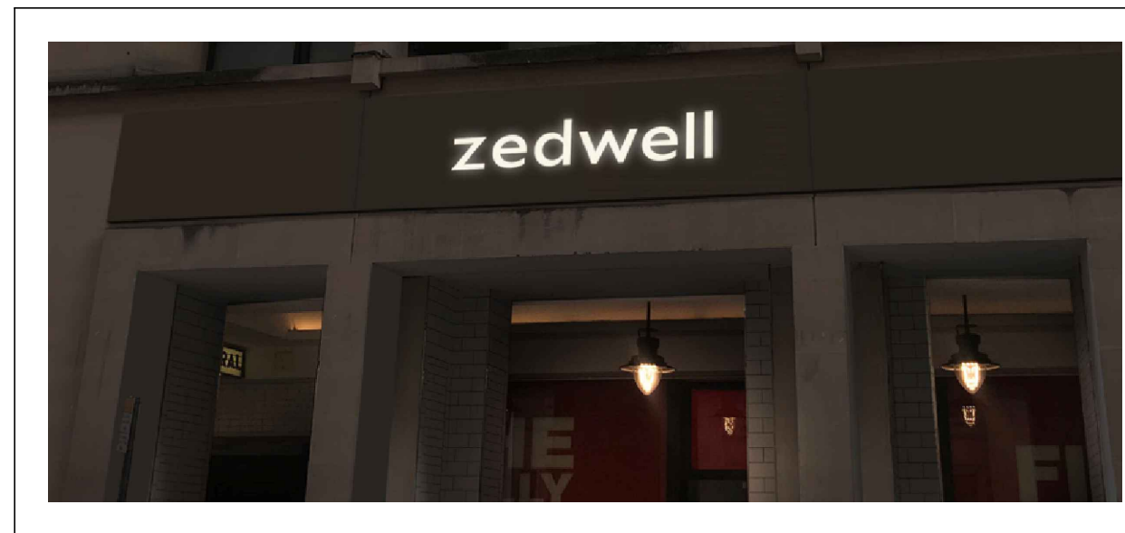
4 Reference of Sign 1 (Fascia Tray Sign)