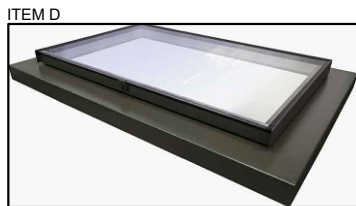
FLAT ROOF LIGHT