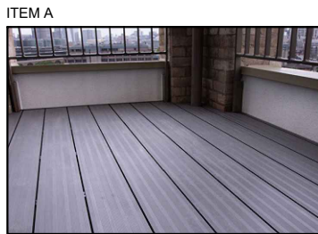
NON COMBUSTIBLE DECKING