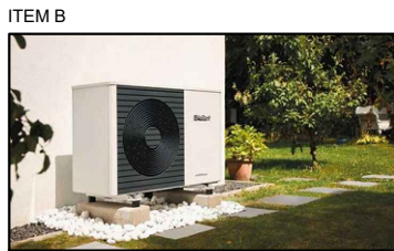
AIR SOURCE HEAT PUMP